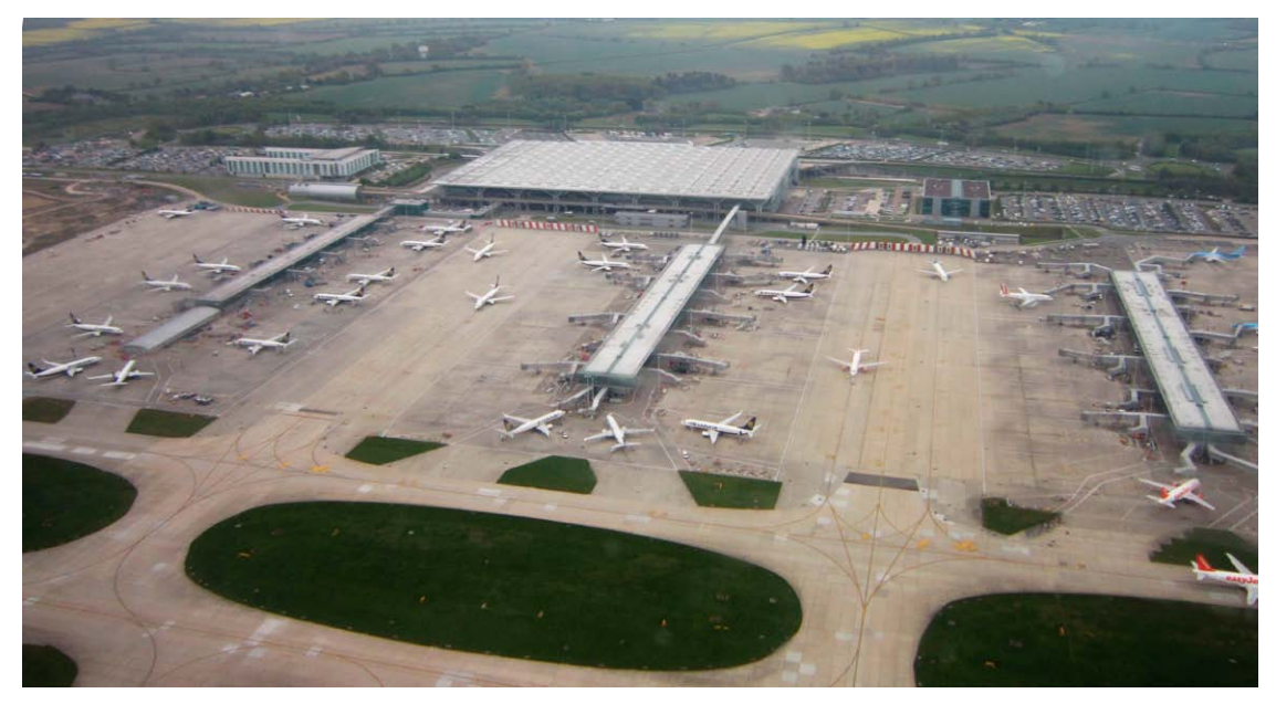
Creative Commons CC0 1.0 Universal Public Domain Dedication

Unit: 39 Signal Regiment (Special Communications), 31 Signal Regiment and 71 Signal Regiment, Army Reserve