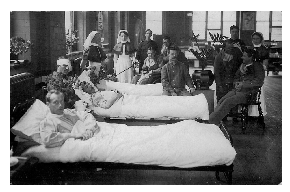
British military nurses and their patients during WWI.