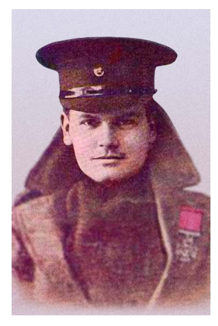
Creative Commons Attribution-ShareAlike 3.0 License / GNU Free Documentation License, Version 1.2

Unit: Queen Victoria's Rifles, the 9th Battalion of the London Regiment, Territorial Force