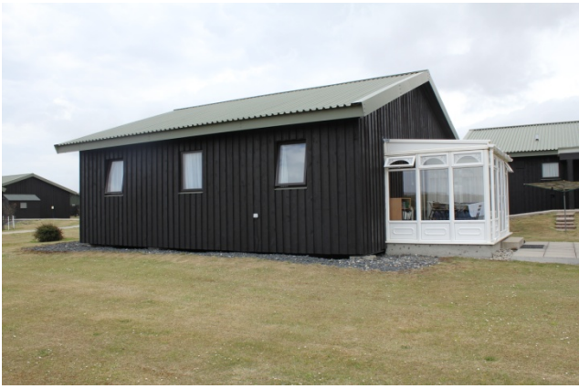
- A 3 Bedroom house in Langworthy

The inventory in each house can vary greatly. It is best to contact the person you will be replacing to get an accurate list. However, the basic inventory for each 3-bed house supplied by the Barrack Store is as follows:-