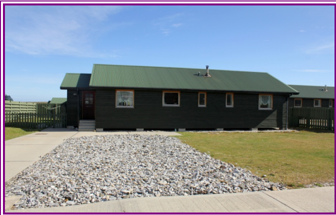
- One of the 4 Bedroom houses