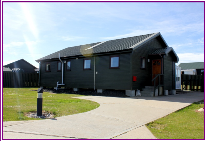
- A 3 Bedroom house on Hamilton

These quarters are located past the children's play park, behind the 120 Facility building.