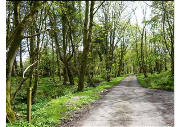
Netherlaw Glen, Kirkcudbright Training Centre