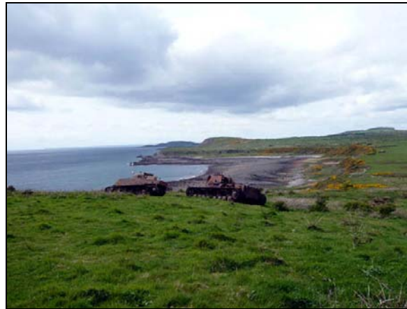
Mullock Bay, Kirkcudbright Training Centre