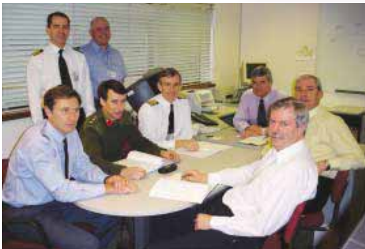
JPA Rollout Team