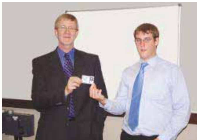
CE receiving ID card

In addition to these early organisational changes, an Agency Operating Model has been developed that sets out the future organisation of AFPAA and the main transitional steps. These will lead to the establishment of the JPAC delivering a wide range of joint personnel administration services, together with the full range of supporting services required to operate the Agency. In parallel with this organisational work, the Agency has launched a programme designed to embed the values and behaviours required to underpin the future success of the Agency with, in particular, an even sharper focus on customer service. This will build on the existing, successful and highly regarded partnering relationship with EDS and has begun with the top management team and senior managers completing a series of workshops exploring modern day leadership concepts, which will help develop the AFPAA behaviours for the future. The year ahead will see further training, development and coaching for everyone across the organisation.