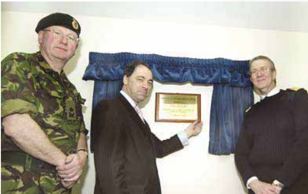
Minister, DCDS (Pers) and CE at the opening of the MOD Medal Office

In the nearer term AFPAA is also examining with colleagues in the Veterans Agency ways of improving service delivery to veterans and their dependants, some of whom are served by both Agencies, through greater integration of services. Some short term steps towards closer working have already been agreed and the Under Secretary of State for Defence announced in March 2005 a further study involving the Agencies to determine whether merger would be beneficial to service delivery. Conclusions are expected in the summer of 2005.