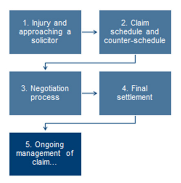
Figure 4.1: Stages in the personal injury claims process

This chapter summarises the different stages of the personal injury claims process, as outlined by stakeholders, claimants and deputies, with reference to the role of the discount rate in this process. Figure 4.1 gives an outline of each of the key stages in this process. Chapter 5 provides important context about claimants' preferences for the different types of settlement and their experiences of spending and investing their compensation, while chapter 6 presents the findings on ongoing claim management (stage 5).