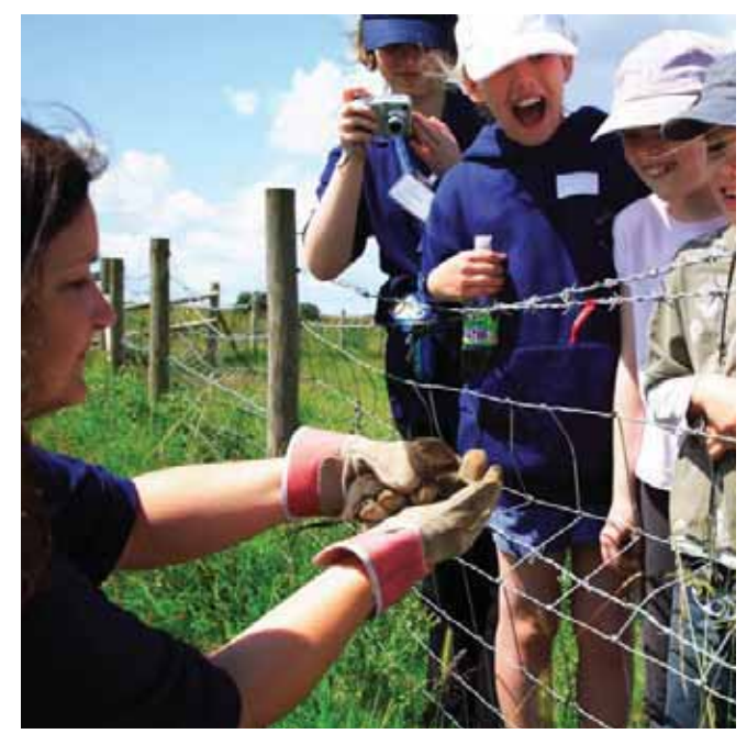
An educational visit to Rainham Marshes.

At Rainham Marshes, within the Thames Gateway, we are working with the RSPB and the London Borough of Havering to secure significant new access to the marshes and Thames Riverside enabling people to enjoy this area for the first time in over 100 years.