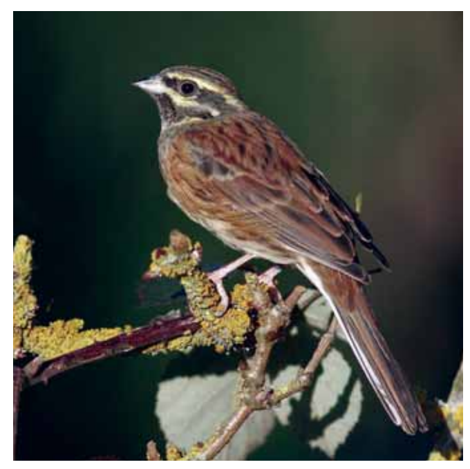
Male Cirl bunting.

For example, the Cirl bunting reintroduction project, which involves local farmers, Natural England, RSPB, Paignton Zoo and the National Trust, has re-established a breeding population of Cirl buntings in Cornwall after they became extinct in the county over 10 years ago. Another project has improved the wildlife of rivers and streams in Cumbria by encouraging natural river processes, fencing out stock and clearing invasive non-native plants.