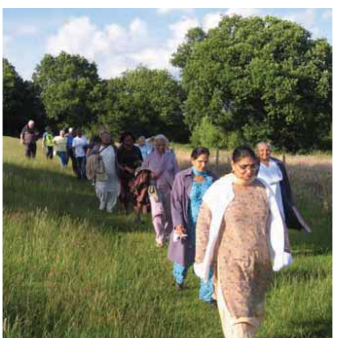
On the Seven Cornfields Walk, Wolverhampton.

The effectiveness of green exercise as part of healthcare treatment and disease prevention has to date been hard to quantify. Natural England has worked with the National Institute of Health and Clinical Excellence (NICE) and other academics to develop a simple Outdoor Health Questionnaire that is being promoted to Natural England's 525 WHI schemes. The comparable evaluation data collected will be used to inform the NICE Review of Physical Activity and feed into the review of the Quality Outcome Framework (QOF) in 2009, the basis on which GPs are funded.