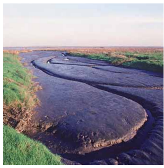
Looking to the River Great Ouse from Terrington Marsh SSSI.

Recent improvements in the harvesting of shellfish, and the newly agreed shellfish management policies, have resulted in additional areas of the SSSI being in favourable or recovering position. This is testament to the efforts made by all parties to bring about a massive turn around in the health of the Wash.