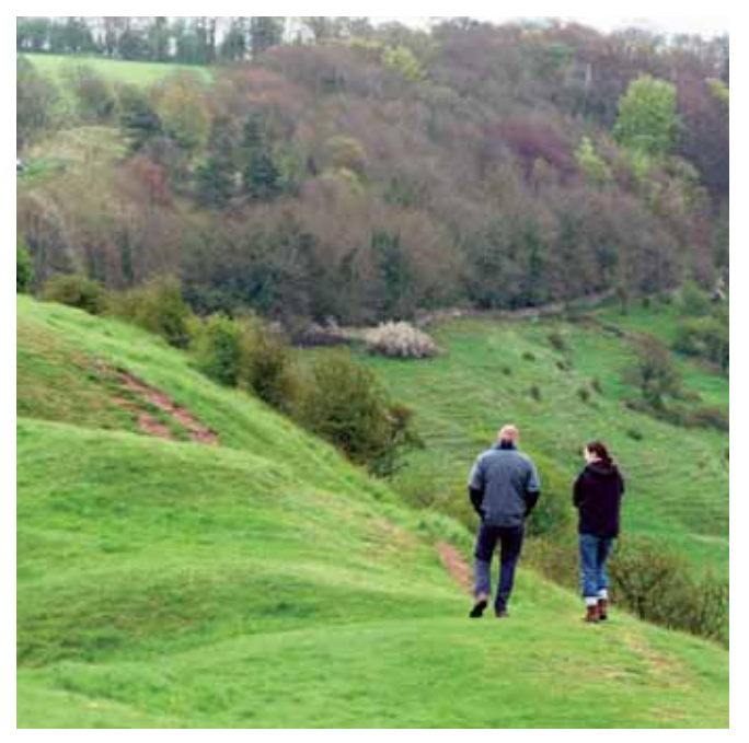
Walking on the Cotswold escarpment.

The Trail is supported by a detailed guide book, website, and accommodation and public transport information, and should bring lasting economic benefit to the local economy. Over 84,000 people have used the Trail since it was launched.