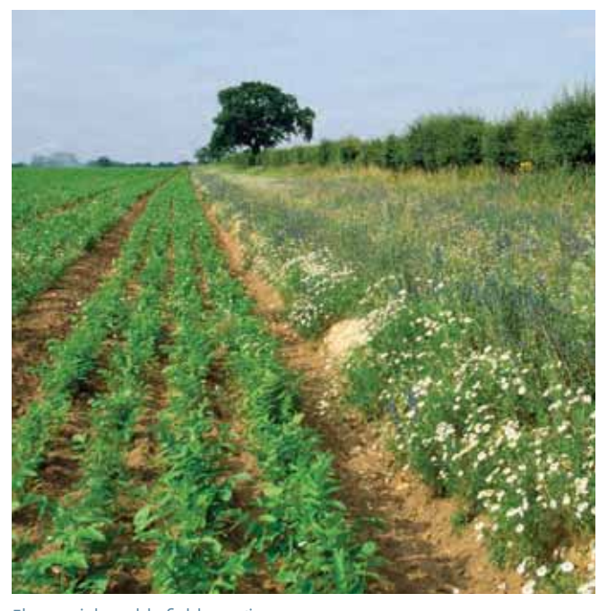
Flower rich arable field margin

The new approach will provide clarity and transparency and will be fully implemented by October 2008.