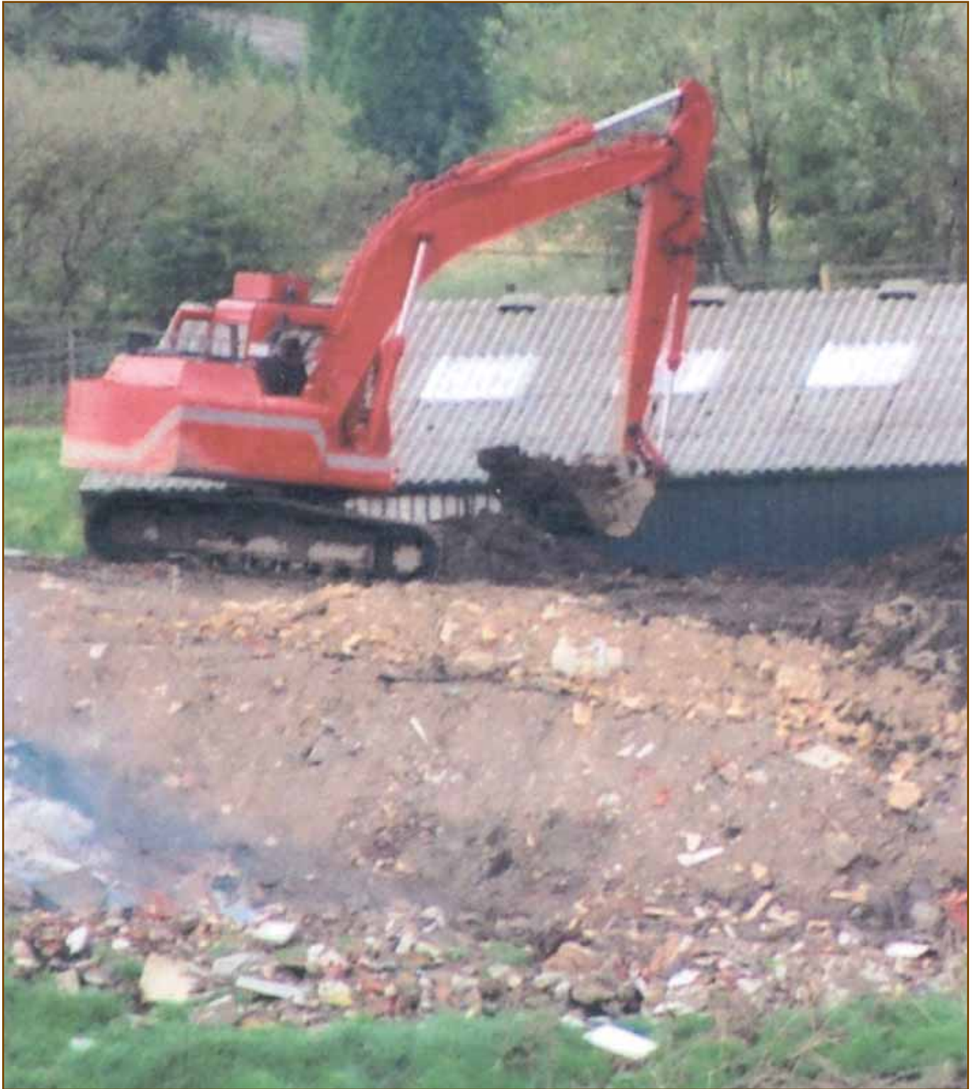
Photograph of excavation on neighbouring land (paragraph 51).