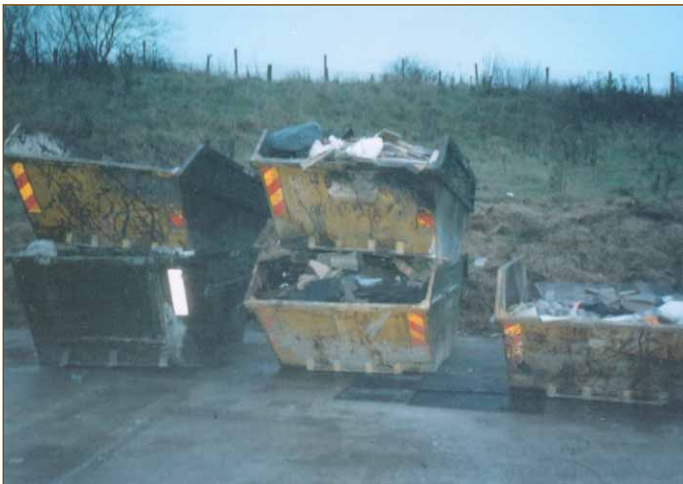
Photograph of skips on neighbouring land (paragraph 110).

Council would be unable to enforce the notices it had issued, because it had no evidence of what the land had been like before. He had told the Borough Council that its notices were too imprecise and that the County Council could not therefore take the case from it. The former officer said that he had not returned to the site because, as far as he was concerned, the very narrow issue of burning was being tackled by the Agency. There would be no added value in the County Council just issuing another enforcement notice. He said that it was important for the different authorities not to duplicate the use of their powers, because