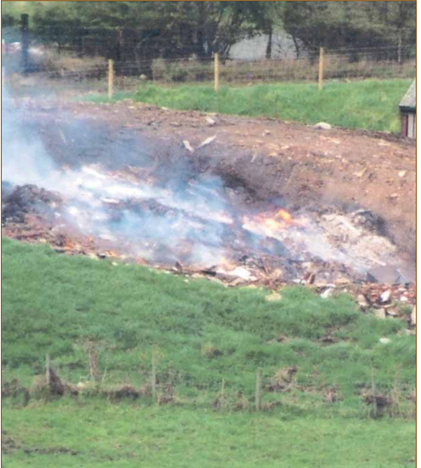
Photograph of the 'burning pit' on neighbouring land (paragraph 52).