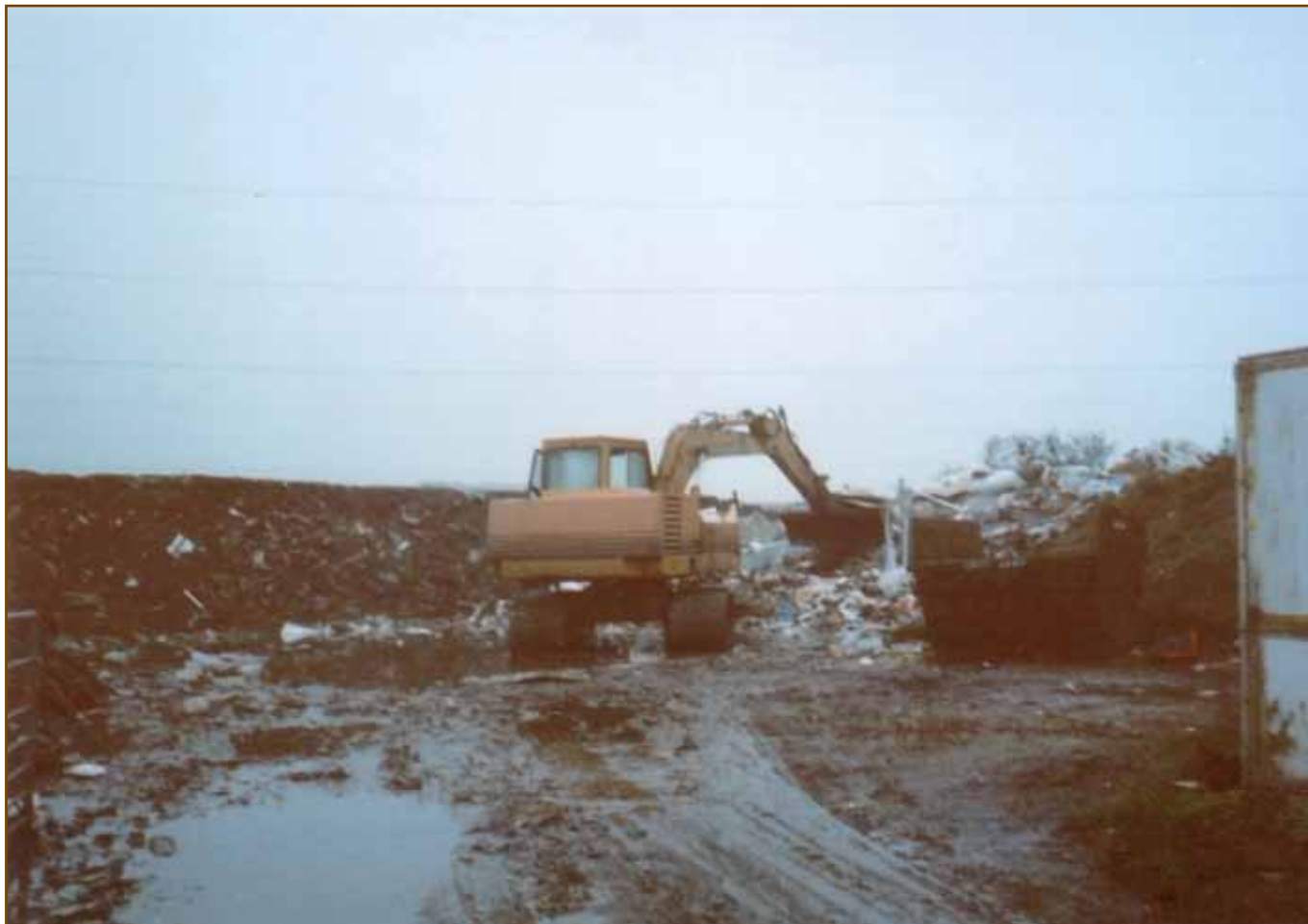
Photographic evidence of tipping on neighbouring land (paragraph 127).

little point in asking for the notes (paragraph 92) as they would simply be created after the event. Further, when they visited the farm, sometimes days after tipping had been reported, they said that they had not actually seen the waste being tipped and could not therefore verify that it had been imported. Even when Agency officers did eventually witness the tipping of controlled waste on two occasions, no prosecution for the deposit of waste followed (presumably because the 'other stages' of the offence had not been witnessed). It would appear, therefore, that the officers were not at all clear as to