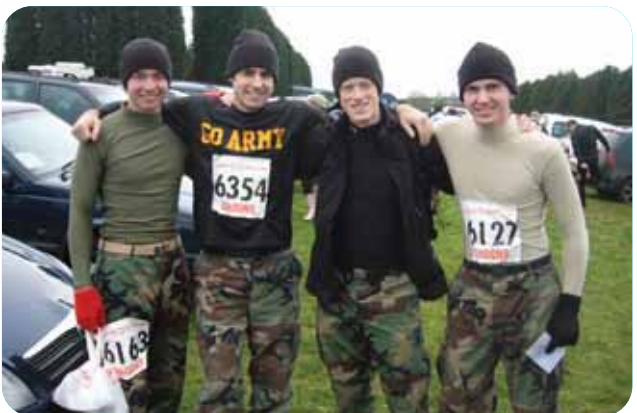
Marshall Scholars compete in the 'Tough guy' competition