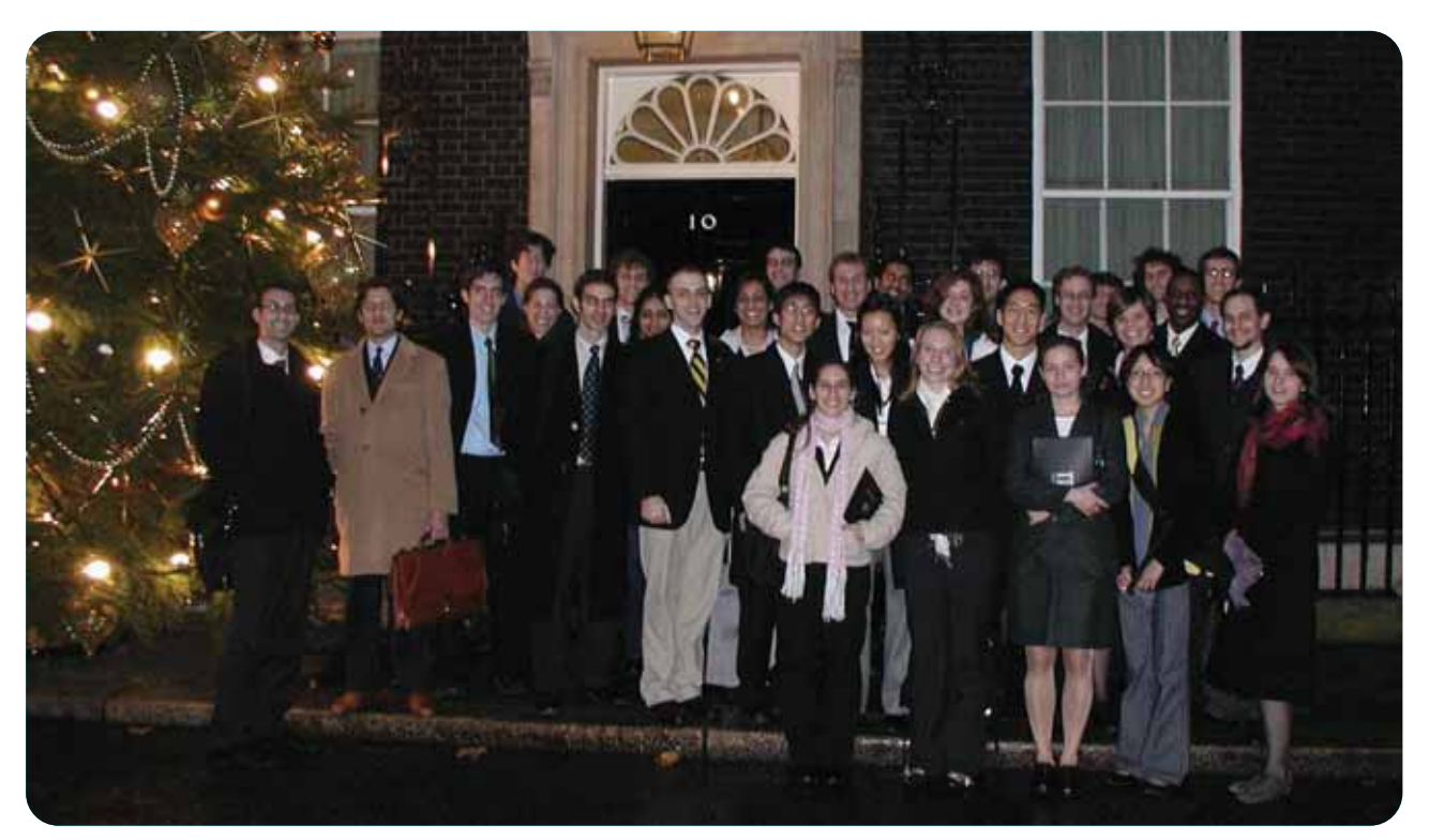
Marshall Scholars on their visit to 10 Downing Street