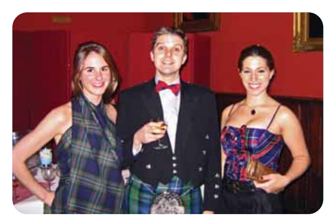
Celebrating Burns Night

I have conducted my work in accordance with Bulletin 1999/6 "The auditor's statement on the summary financial statement" issued by the Auditing Practices Board for use in the United Kingdom. My report on the Commission's full annual financial statements describes the basis of my audit opinion on those financial statements.