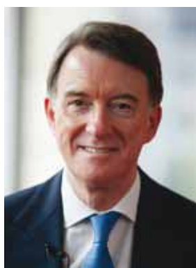
Peter Mandelson Secretary of State for Business, Innovation and Skills

Skills are a key part of our plan for economic recovery and, as such, an urgent challenge. This country's future can only be built by educated, enterprising people with the right skills; the skills demanded by modern work in a globalised knowledge economy. Skilled people are more productive, they are more innovative, and they build stronger businesses.