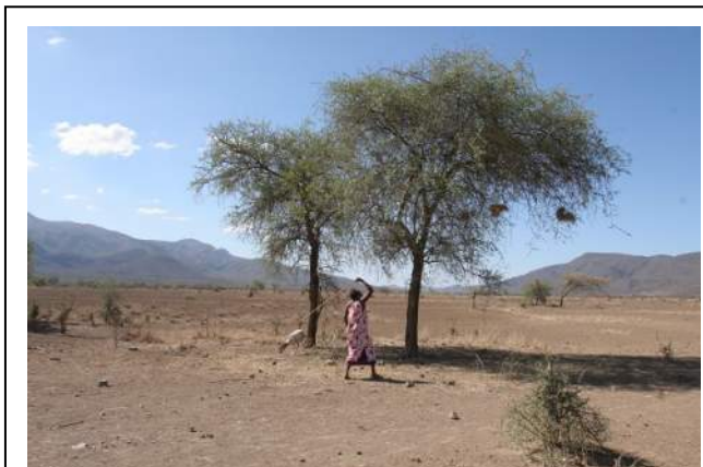
Maasai woman collecting fodder. Until recently this area of Kenya has had no rains for 3 years

Achieving the strategic objective, both in the shape of the post-2012 framework agreement and financing for adaptation, depends on the outcome of UNFCCC negotiations. These will be unclear before Copenhagen COP with details like implementation modalities settled in 2010. At that point we expect strong relevance of our practical work on adaptation and institutional framework analysis.