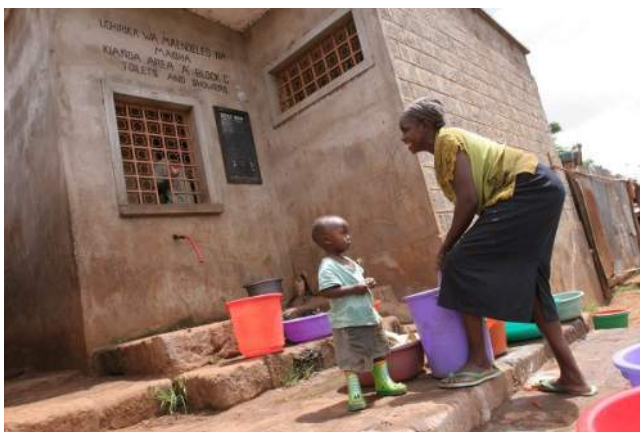
Sanitation block in Kibera, Nairobi, for toilets, showers and washing with hot water from biogas

99,779 people living in informal urban settlements acquired direct access to better infrastructure the activities of target organisations. As a surpass the international target for the Goal. an water through a partnership with major he World Urban Forum and BOND networks on enya there is increasing impact of participatory planning on budgeting and we are beginning to influence waste related policies and practices.