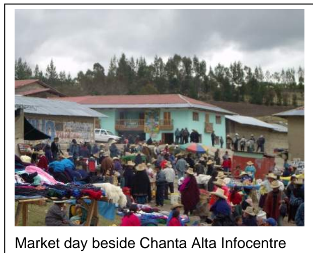
Market day beside Chanta Alta Infocentre

40,000 development practitioners are now registered with the service. Over the 12 months to April 2009, Practical Answers responded to 6,292 technical enquiries from 92 countries, and there were 560,409 downloads of technical materials from 172 countries. On top of this, 70,000 were downloaded in Spanish from Soluciones Prácticas in Peru and 1,278 in Tamil and Sinhala from the Janathakshan site managed by the Sri Lanka office. Enquiries and downloads were used by disadvantaged social groups and communities, development workers and intermediaries with additional knowledge services provided through media that included print, radio, TV, demonstrations, exhibitions and telecentres. Examples of approaches to achieving knowledge access for the poor are provided in the case studies.