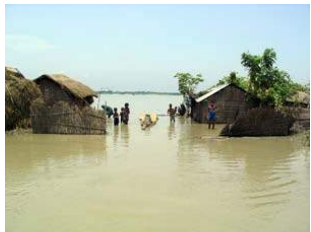
Char family evacuating floods

In Good Practices for Community Resilience we report on work carried out in Bangladesh over a five year DFID-funded project “Mainstreaming Livelihood-centred Approaches to Disaster Management”, also underway in Nepal, Sri Lanka, Zimbabwe and Peru. The narrative gives an account of good practices since January 2006, identifies achievements, successes and lessons learned, and includes nine case studies that explore how the resilience of local communities can be increased and vulnerabilities reduced.