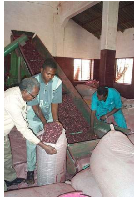
Hibiscus processing for export

In Sudan, the National Farmers' Union and Eid El Neil a local CBO have secured a credit line of US$62,000 from the Cooperative Development Bank to fund the purchasing of complete, high value hibiscus flowers from small farmers living in crisis affected communities. This joint venture uses the musharka ('partnership') mode of Islamic finance under a new policy framework targeting the micro-financing of small marginal producers for which Practical Action successfully lobbied during 2007-8.