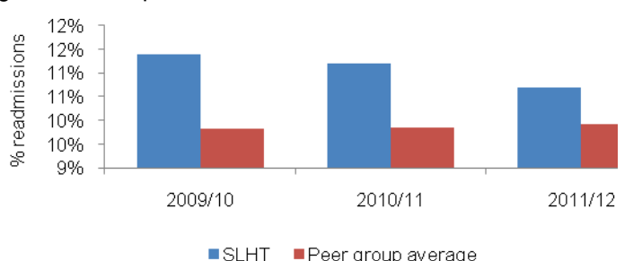
Figure 14: Comparable SLHT re-admission rates, 2009/10-2011/12<sup>36</sup>