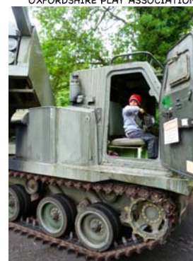
A happy attendee!

Oxfordshire Play Association is a charity founded in 1974. In September 2011 we submitted an application to the Community Covenant Grant Scheme to run a Play Day event at each of the six Armed Forces bases across Oxfordshire for £15,000. The aim was to provide a free event for Service personnel, their families and their local communities so as to promote greater mutual integration and understanding between both communities. The planned events would not only offer activities for children and young people but also provide advice, information and guidance for parents and carers in a welcoming, family-friendly space that allows for networking opportunities.