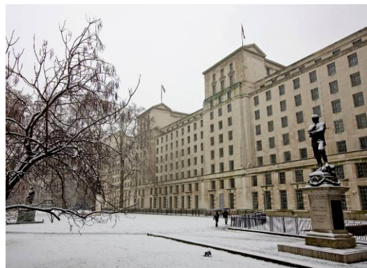
The MOD Main Building in Whitehall, London

Sessions will include workshops, seminars and speeches. The Conference will also provide delegates an opportunity to meet the MOD Community Covenant team, other Local Authorities, representatives from Devolved Authorities, charities and members of the Armed Forces. Further information (including registration details) are on our website or COVENANT-MAILBOX@MOD.UK