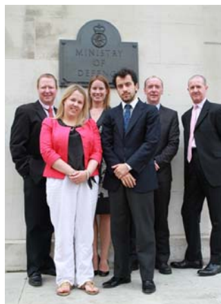
The Armed Forces Covenant Team at the Ministry of Defence

Welcome to the first edition of the quarterly Armed Forces Community Covenant e-Newsletter! Here you will find information about the work that people across the UK are doing under the Community Covenant and the partnerships that are being formed as a result. To mark our 100 th signing of the Community Covenant, we have a project update from Oxfordshire , one of the first Communities to sign the Covenant. We also have pieces from two newer signatories, Havering Council and Edinburgh Council and an interview with Colchester .