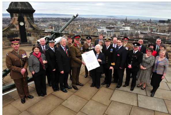
The Signatories of the Edinburgh Community Covenant on Edinburgh Castle

A key priority to be taken forward over the next three years is to share information on services and good practice, as well as to enhance co-ordination between the Armed Forces, statutory organisations and the voluntary sector. The Edinburgh Partnership Community Covenant gives a renewed focus to this work.