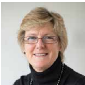
Professor Dame Sally C Davies Chief Medical Officer Chief Scientific Adviser Department of Health

Although it seems we barely saw the sun last summer in England, last year's Climate Change Risk Assessment clearly indicated that we are increasingly likely to experience summer temperatures that may be harmful to health. For example the temperatures reached in 2003 are likely to be a 'normal' summer by 2040, and indeed globally, countries are already experiencing record temperatures. We do not know whether or not there will be a heatwave over the course of this summer, but we do want to make sure that everyone takes simple precautions to stay healthy during hot spells and when in the sun.