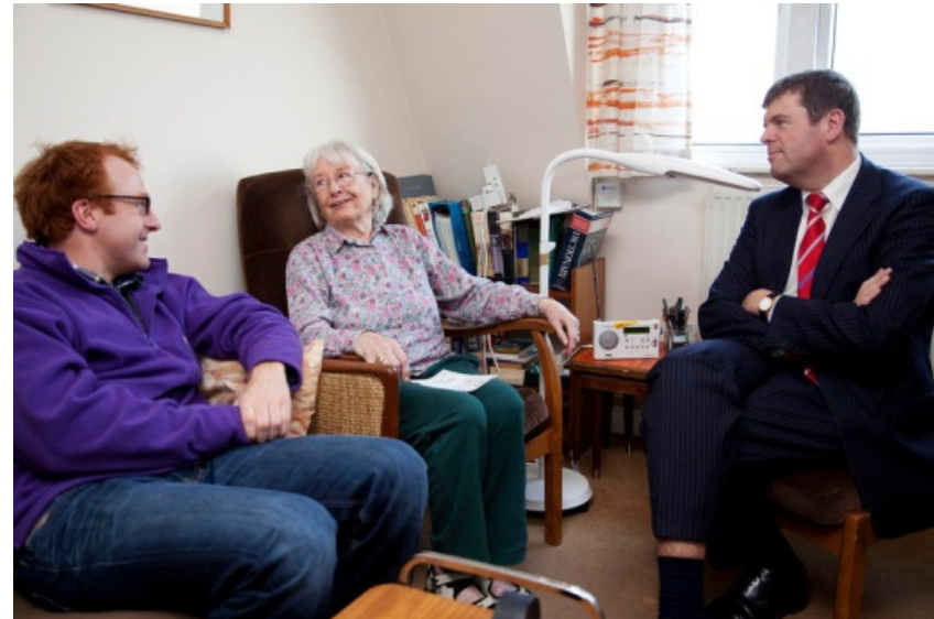
Paul Burstow MP, Minister for Care Services meets WRVS befrienders before Campaign Summit

Campaign to EndLoneliness CONNECTIONS IN OLDER AGE