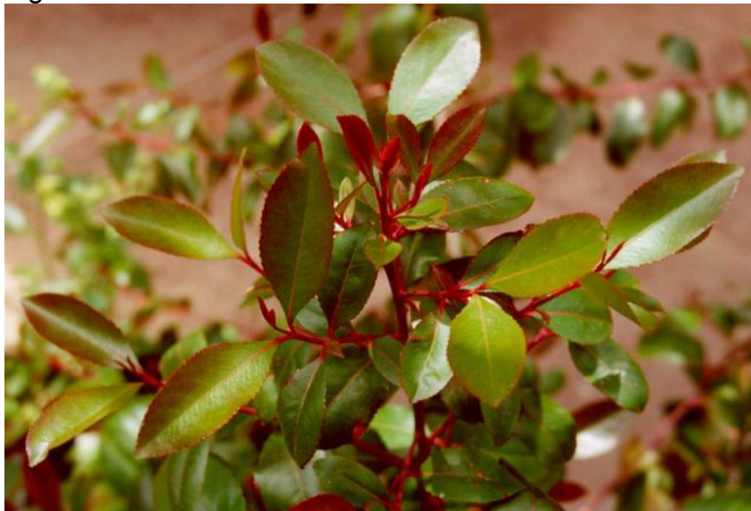
Fig1: The Catha edulis shrub.

Khat is a herbal product consisting of the leaves and shoots of the shrub Catha edulis (Fig 1). It is cultivated primarily in East Africa and the Arabian Peninsula, harvested and then chewed to obtain a stimulant effect. There are many different varieties of Catha edulis depending upon the area in which it is cultivated. Khat use has been reported for centuries, there are Arab reports that it was being used in Yemen in the sixth century. Ethiopians may have brought it to Africa after conquering Yemen, and its use spread from here in the fifteenth century. Khat first came to the attention of the non-Arabic world in 1775 when its use was characterised by European botanists visiting Yemen 1 . It is known by a variety of different names (see box 1).