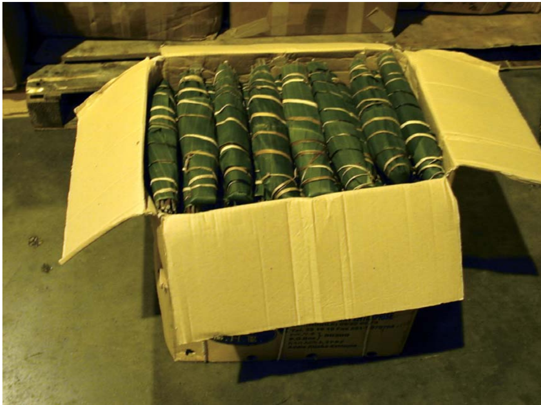
Fig 4: Bundles of khat wrapped in banana leaves packed into a box.

Khat is imported from the khat growing regions of Kenya, Ethiopia and Yemen. The UK is a major destination for imports and exports of khat onto other countries in the world. In the first 6 months of 2005 there were imports each day of approximately 5-7 tonnes from Kenya, 500kg from Ethiopia and 175 kg from Yemen (equates to roughly 25000 bundles or doses), the bulk of which was held in transit for export to the US (Joe Onofrio –personal communication). Khat arrives packaged in boxes with 50-100 bundles of khat wrapped in banana leaves inside (Figs 4&5) It is clear that the UK is a conduit for the distribution of khat to other countries in the world where it is illegal.