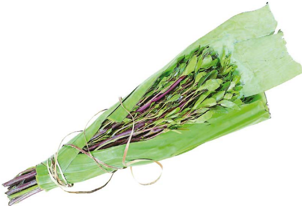
Fig3: A bundle of khat.

(24%) a week 2 . The majority of khat users (60%) chewed 1 or 2 bundles of khat in an average chewing session, and an average session lasted 6 hours (range 1-20 hours). A bundle (Fig 3) is an inexact measure of khat use but is approximately 250g of the plant catha edulis , including the stalks and leaves. A bundle of khat typically sold in a mafresh costs about £3-5 (Axel Klein, DrugScope –personal communication).