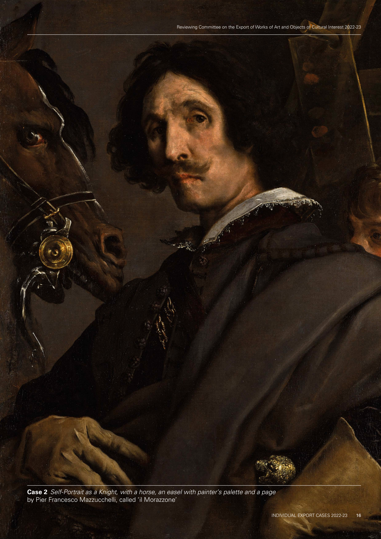
Case 2 Self-Portrait as a Knight, with a horse, an easel with painter's palette and a page by Pier Francesco Mazzucchelli, called 'il Morazzone'