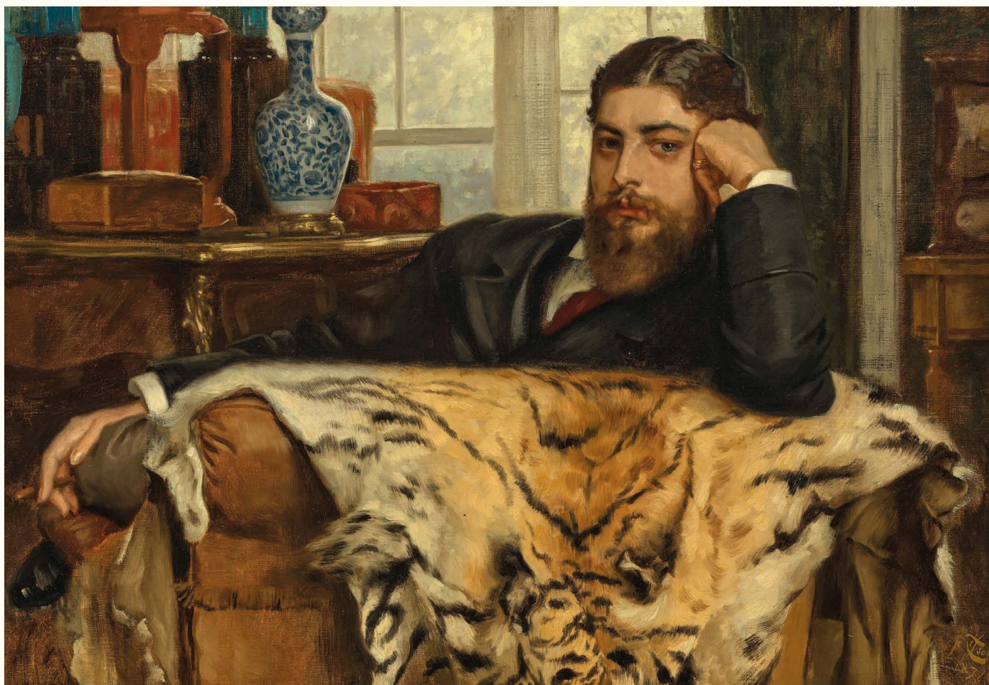
Case 1 Algernon Marsden by Jacques Joseph 'James' Tissot

The Senior Curator of European Art at the Ashmolean Museum, acting as expert adviser, objected to the export of the painting under the second and third Waverley criteria. It was of outstanding significance for the study of the history of collecting, the formation of