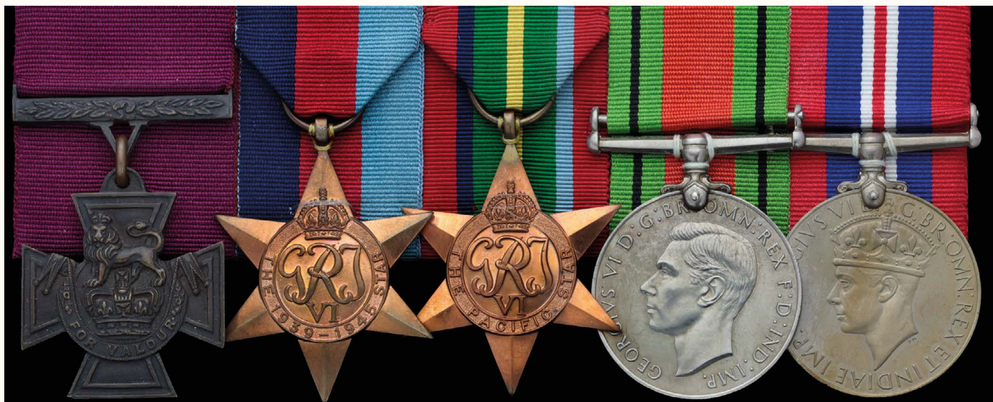
Case 7 Victoria Cross posthumously awarded to Squadron Leader A.S.K. Scarf, Royal Air Force, and four other of his medals

We, therefore, recommended that a decision on the export licence should be deferred for an initial period of three months to enable an offer to purchase it to be made at the agreed fair market price of £660,000 (plus VAT of