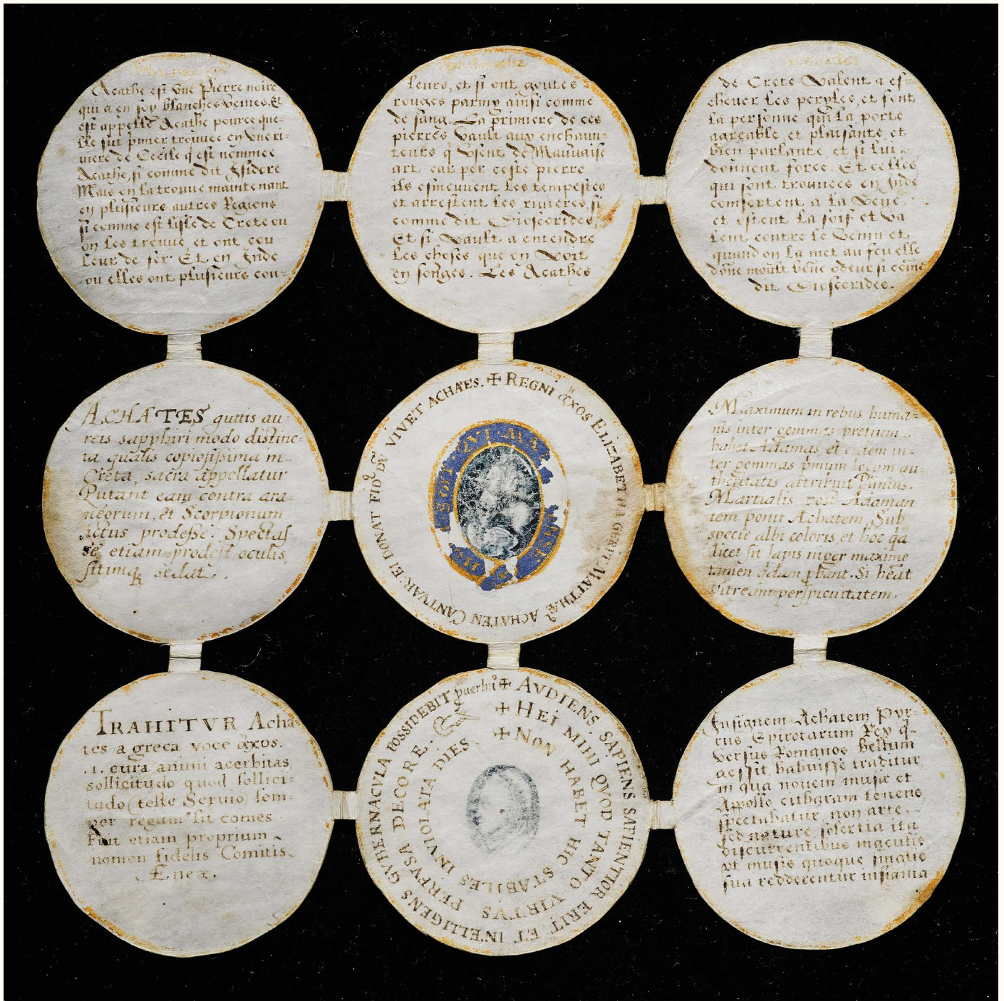
Case 4 Nine conjoined roundels, presentation manuscript for Queen Elizabeth I

at the British Library acting as expert adviser, objected to the export of the manuscript under the third Waverley criterion. It was of outstanding significance to the study of the history of the Elizabethan period and for understanding Matthew Parker's role in and use of material culture.