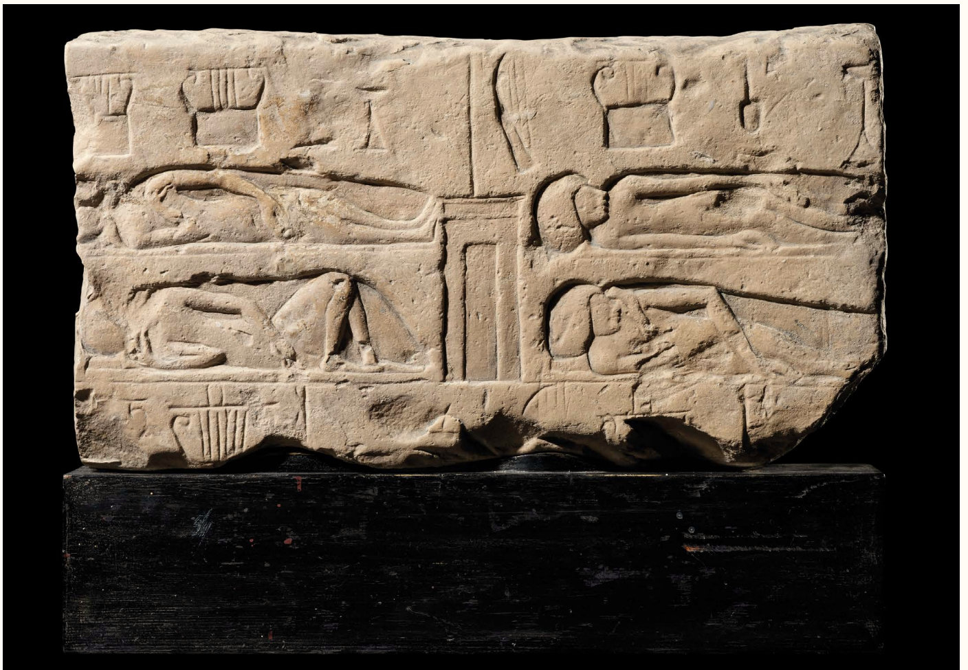
Case 13 An Egyptian limestone relief, Amarna Period