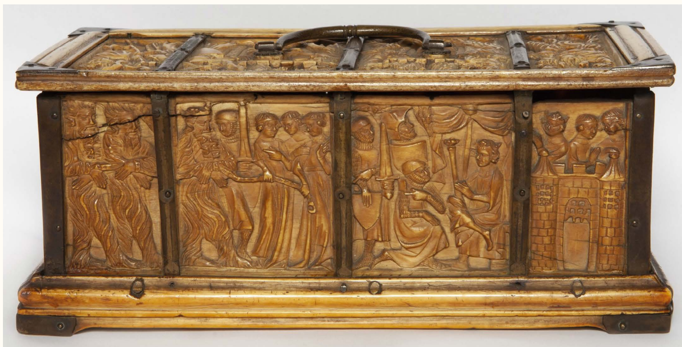
Case 11 French Gothic Ivory Composite Casket

The casket was a significant and unresearched new addition to the important corpus of nine known 14th century French composite caskets depicting scenes from medieval romance tales. The casket's history, since at least the 19th century, closely linked to Tornaveen House, Aberdeenshire, could possibly be traced back to the early 17th century. This made the object significant in the context of the study of the early history of collecting medieval objects in Britain. The casket also included a detailed and very early depiction of Wild Men storming a castle, further confirming its outstanding significance, especially for the study of the history of medieval art.