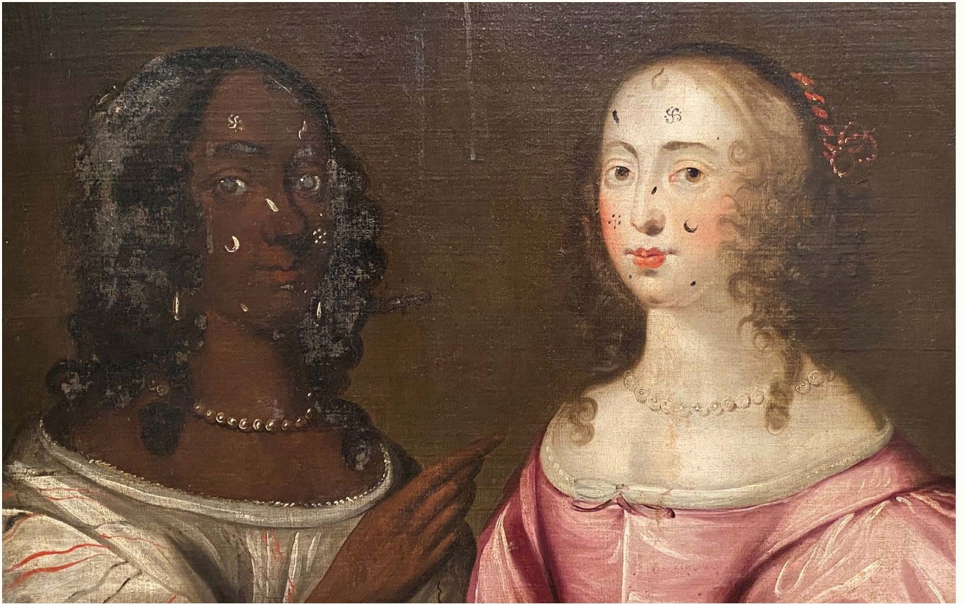
Allegorical Painting of Two Ladies , English School, circa 1650

existence of grant-giving bodies should also be advertised.