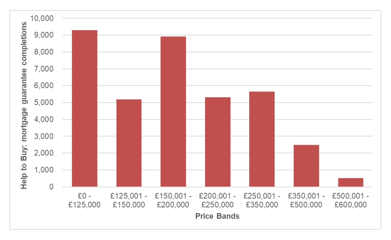
Chart 1: Completions by property value from 19 April 2021 to 31 March 2023