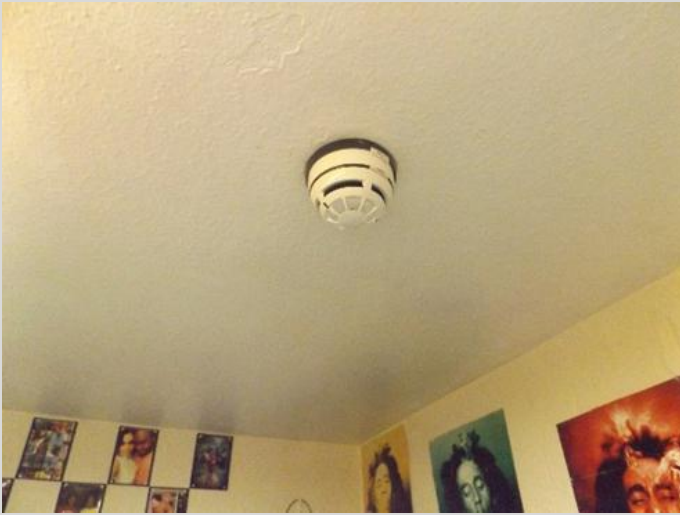
Picture set 1- Smoke detectors in cells