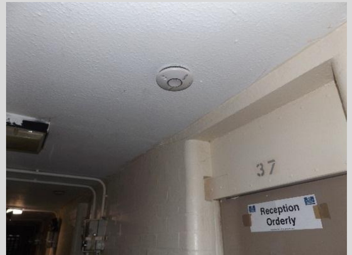
Picture 3- Smoke detection device covered by glove