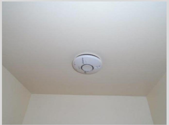
Picture set 2- Domestic smoke detectors located outside of cells