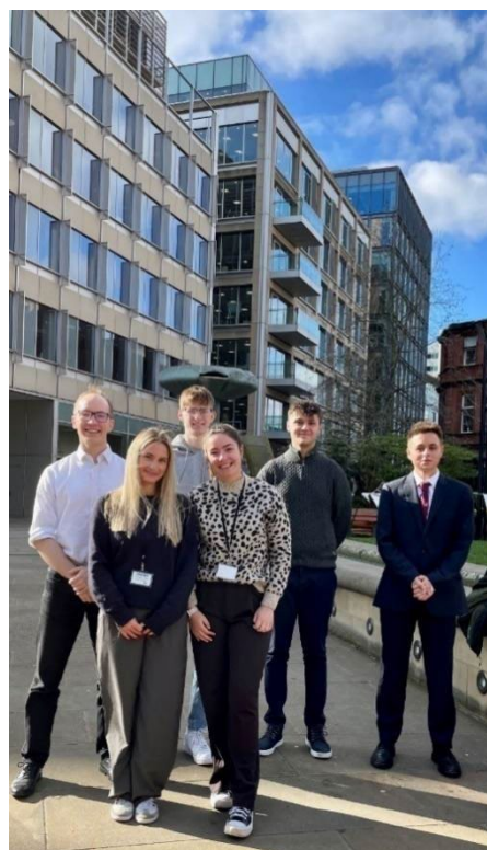
Placement students from the University of Sheffield, outside DfE Sheffield