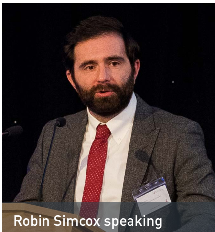
at a CCE conference, December 2022

The challenges England and Wales face from extremist ideologies were once again laid bare in the last 12 months.