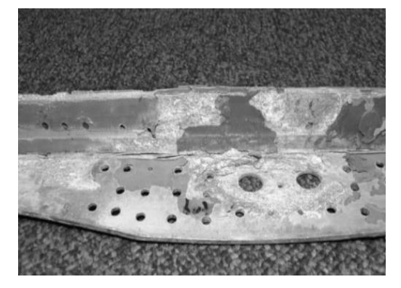
Figure 3 Chinook Ramp Stringer