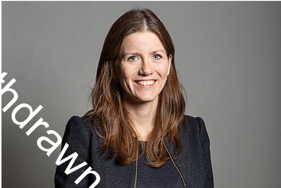
The Rt Hon The Rt Hon Michelle Donelan MP, Secretary of State at the Department for Science, Innovation and Technology

In an increasingly competitive world, we find ourselves facing new challenges in keeping our nation secure, our people prosperous, and our planet healthy.