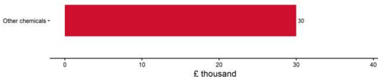
The top 1 UK goods exports, in the four quarters to the end of Q3 2023, to North Korea

The chart below shows the top product exported by the UK to North Korea, by value, in the four quarters to the end of Q3 2023. All data shown in the chart are provided in the text above.