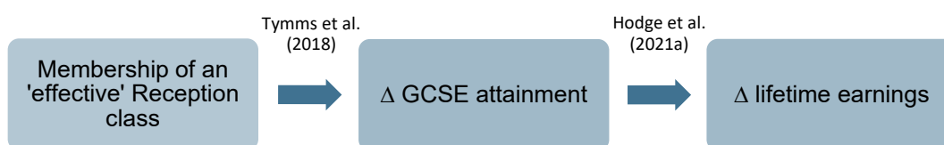
Figure 1: Causal pathway

The respective PIPS and LEO pupil cohorts took their GCSEs between 8 and 10 years apart, and 10 to 20 years from the present day. 16 The GCSE grade distribution has changed somewhat over these time periods: 2017 also saw the phased introduction of a “number” grading system, with a non-identifiable translation between it and the old “letter”