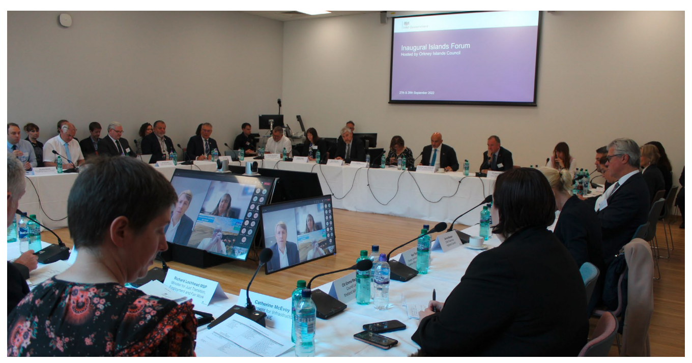
The first meeting of the Islands Forum held in Orkney in September, chaired by the then Chancellor of the Duchy of Lancaster, Rt Hon Nadhim Zahawi MP, attended by representatives from island communities, devolved administrations and UK Departments. Welsh Government Minister for Climate Change, Julie James MS attended remotely.