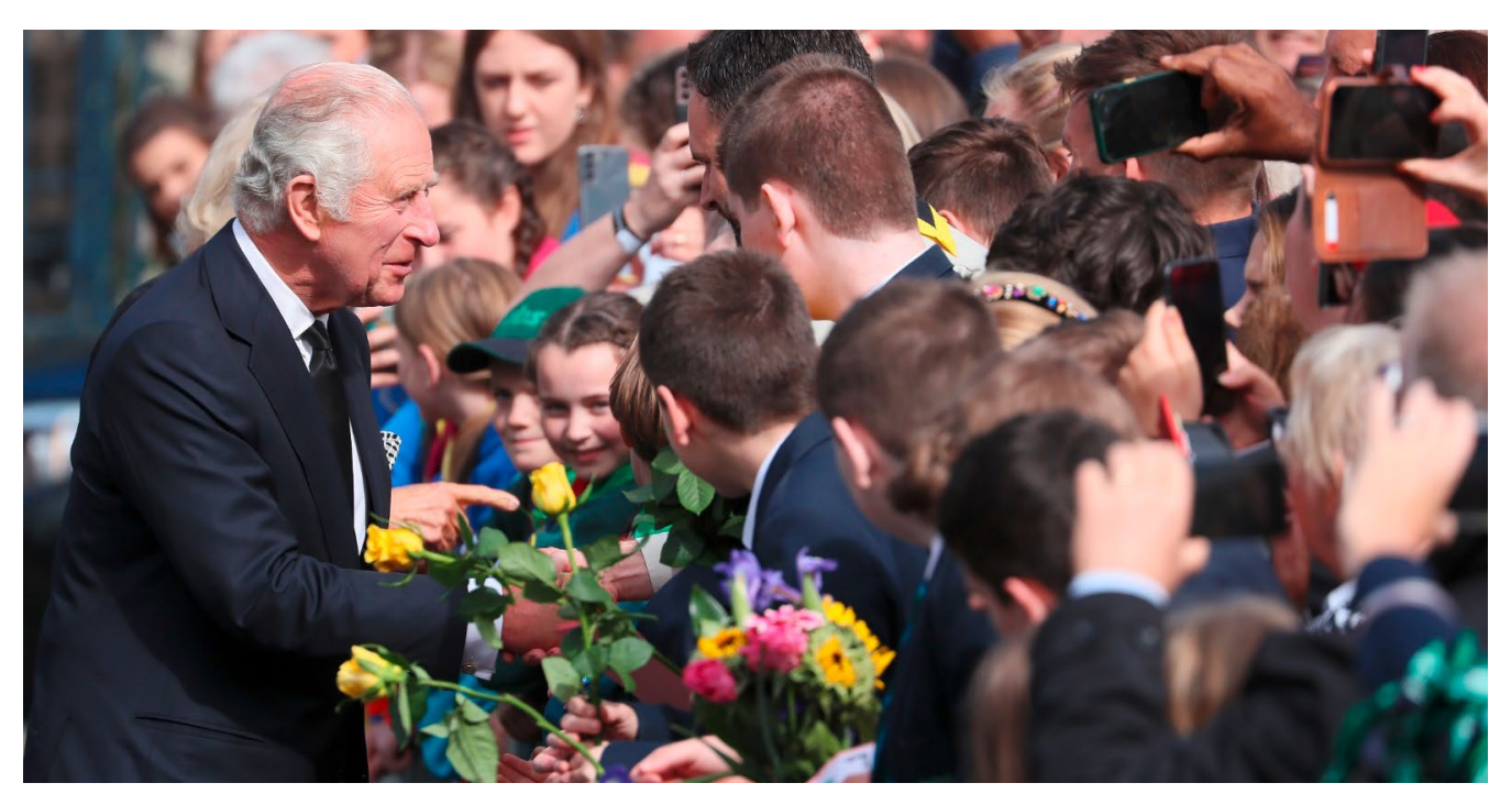
His Majesty The King and The Queen Consort greet crowds outside of Hillsborough Castle.

and from across the world, particularly recognising the role of civil servants across the UK who stepped up to deliver such complex events at short notice.