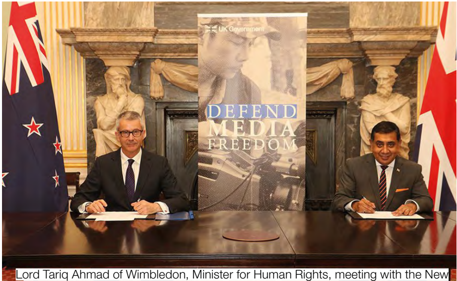
Lord Tariq Ahmad of Wimbledon, Minister for Human Rights, meeting with the New Zealand High Commissioner to the UK, Bede Corry, in July 2021 as New Zealand signed the Global Pledge on Media Freedom...

The High Level Panel of Legal Experts is an independent advisory