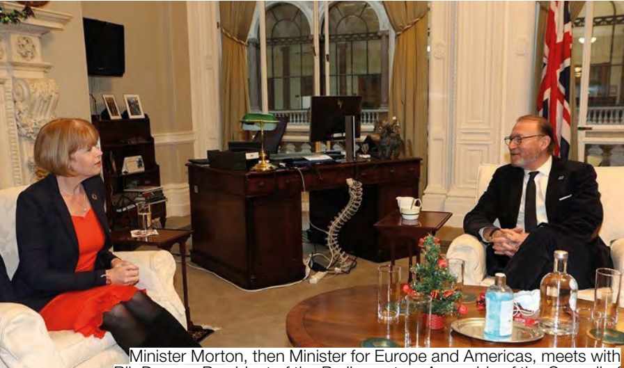
Minister Morton, then Minister for Europe and Americas, meets with Rik Daems, President of the Parliamentary Assembly of the Council of Europe, in December 2021 to discuss topics including the Istanbul Convention, human rights in Russia and FoRB.

The UK will play a key role in shaping the future strategic direction of the CoE following Russia's expulsion from the organisation on 16 March 2022, as a result of its unprovoked invasion of Ukraine. The UK will continue to uphold the European Convention on Human Rights (ECHR) and drive forward human rights standards throughout Europe,