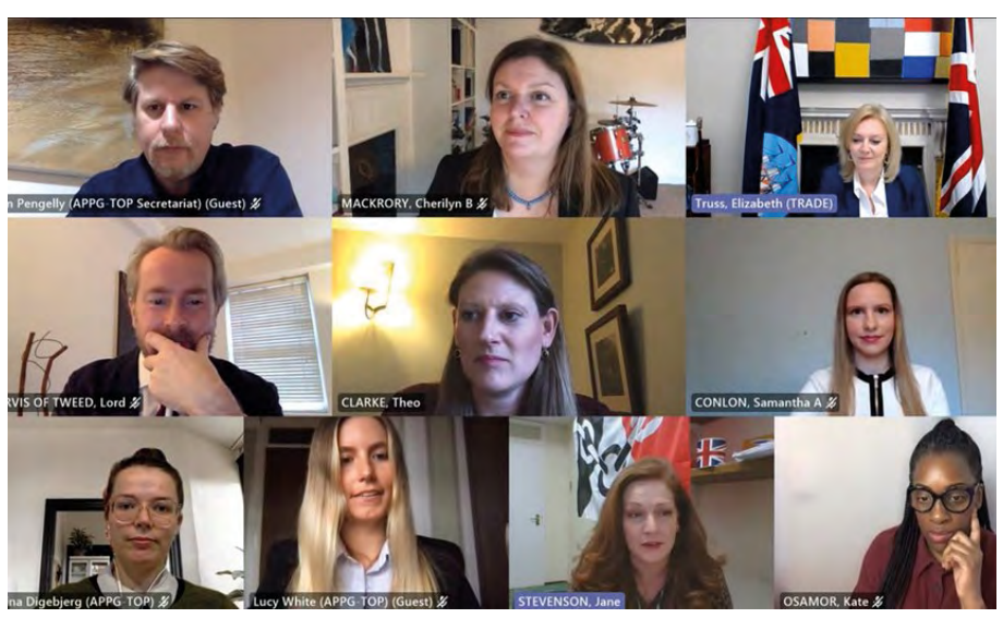
The then Foreign Secretary meets with the UK All-Party Parliamentary Group for Trade Out of Poverty in March 2021, to set out how the UK is tackling the barriers women face in trade and how it is prioritising women's economic empowerment in our Financial Trade Agreements.

Through the UK's co-leadership of the Generation Equality Action Coalition on Gender-Based Violence, which was launched in June 2021,