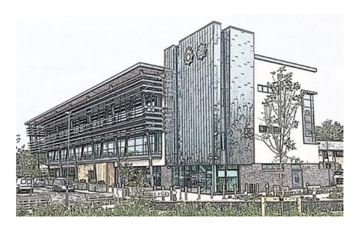
Joint-headquarters for Northamptonshire Police and Northamptonshire Fire and Rescue Service -Kettering

The development of internal data monitoring analytical programmes will allow the Police and Partners to display a consistent approach to Offender Management. Via these digital platforms, it will shape and provide visual representations which display positive outcomes and interventions.