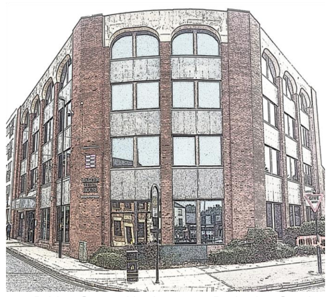
Bridge Street, Northampton Probation Service

In cases were a serious offence has been committed and an offender is sentenced to a minimum of 12 months in prison. Victim Liaison Officers, who are employed by the Probation Service, make contact with the victims via letter. If victims choose to opt into the Victims Charter, these specially trained officer present information on behalf of the individual victims to the MAPPA meetings. This is an opportunity for victims to give their views in regard to the threat the offender may continue to pose. This is a dynamic process. The Victim Liaison Officer forms a vital link between the MAPPA and the victim, updating MAPPA on changes and developments and enabling the MAPPA agencies to respond to changes in risk by reviewing and updating their risk management strategies.