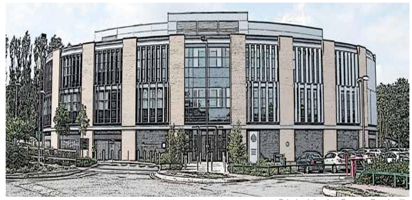
Criminal Justice Centre, Brackmills