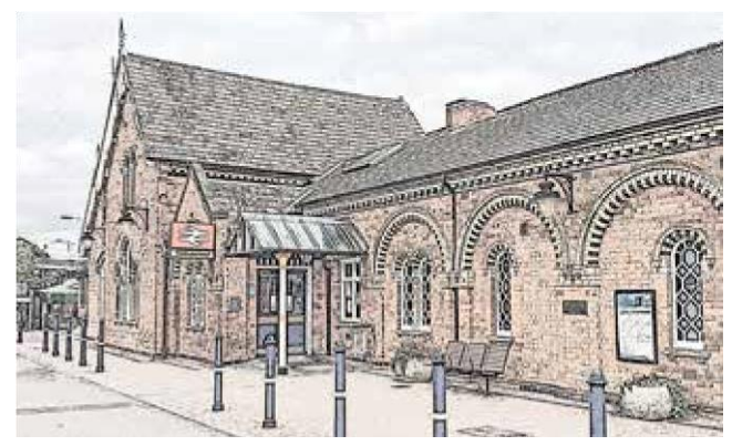
Mainline Station - Wellingborough