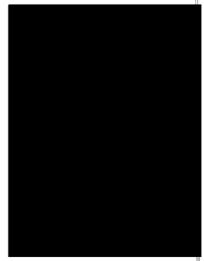
Plan showing location of swimming pool and changing rooms 1 : 500