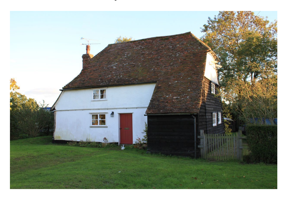
GARDENERS COTTAGE List Entry Number: 1171192 Grade II C16-C17 timber-framed and plastered house with some weather-boarding. Two storeys.