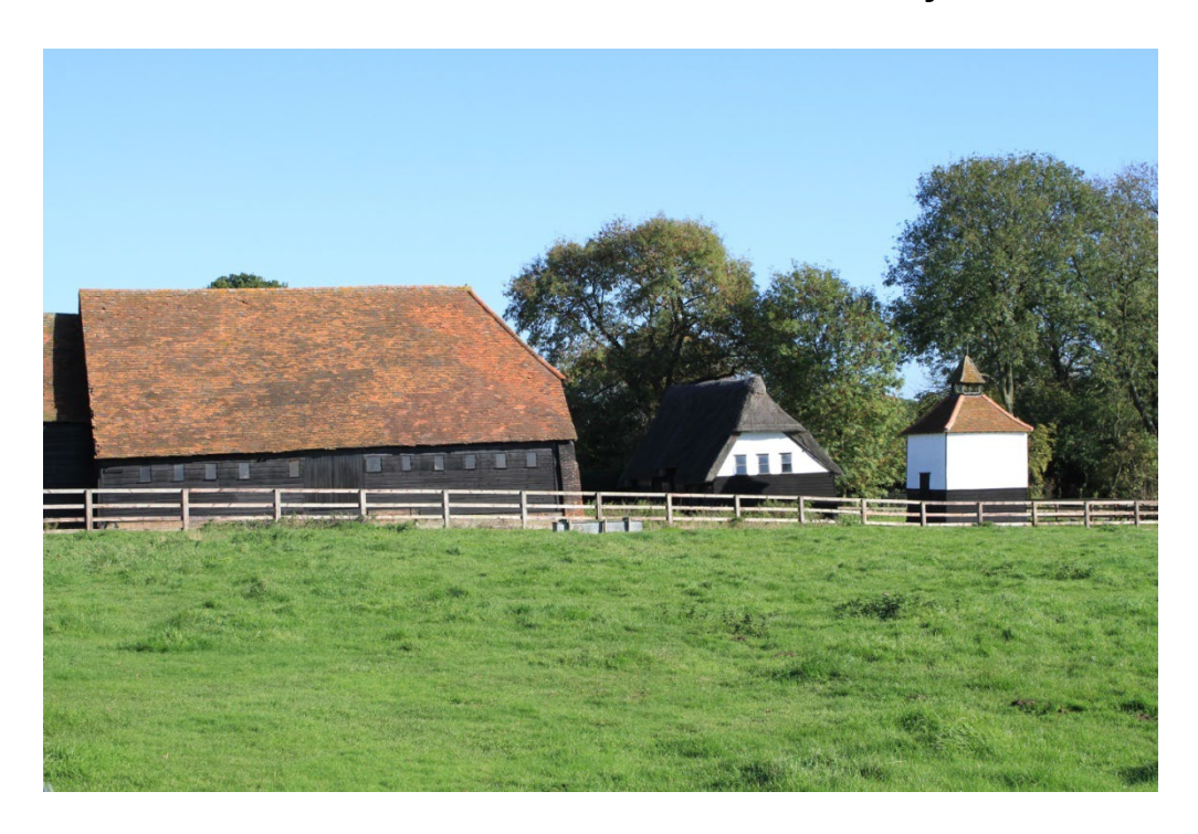
DOVECOTE TO SOUTH WEST OF ELSENHAM PLACE List Entry Number: 1112338 Grade: II

BARNS TO WEST OF ELSENHAM PLACE FRONTING ROAD Grade: Il Listing NGR: TL5401626405 An L-shaped range of C17 and C18 timber-framed and weather-boarded barns, with some plaster on the west side. Roofs tiled. A large C17 barn extends to the east and west with a half hipped roof and C18 barns extends to the south at the west end. List Entry Number: 1171188