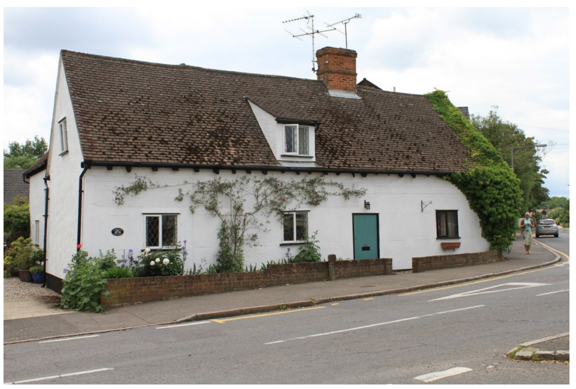
VILLAGE HALL COTTAGE Now Known as Camelia Cottage List Entry Number: 1305746 Grade: Il Early C18 timber-framed and plastered house. One storey and attics.