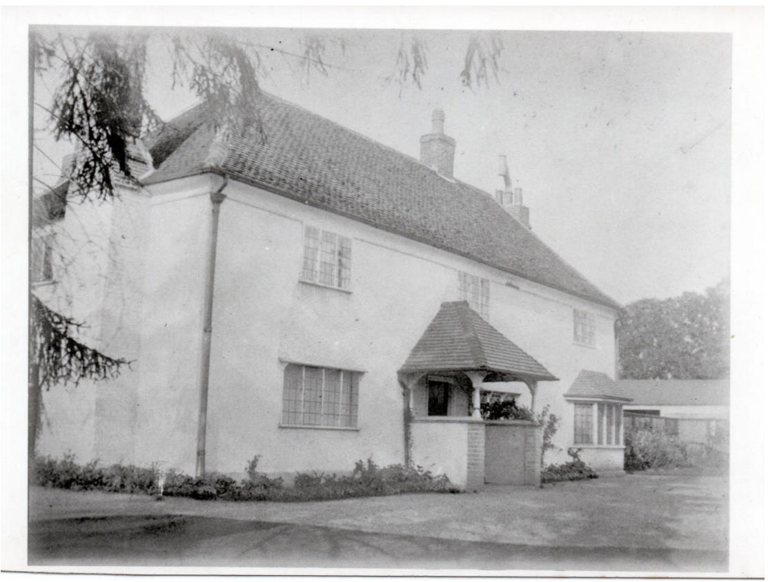
THE LODGE HENHAM ROAD List Entry Number: 1391101 Grade: II 17th century or earlier, timber framed and plastered two storey house.