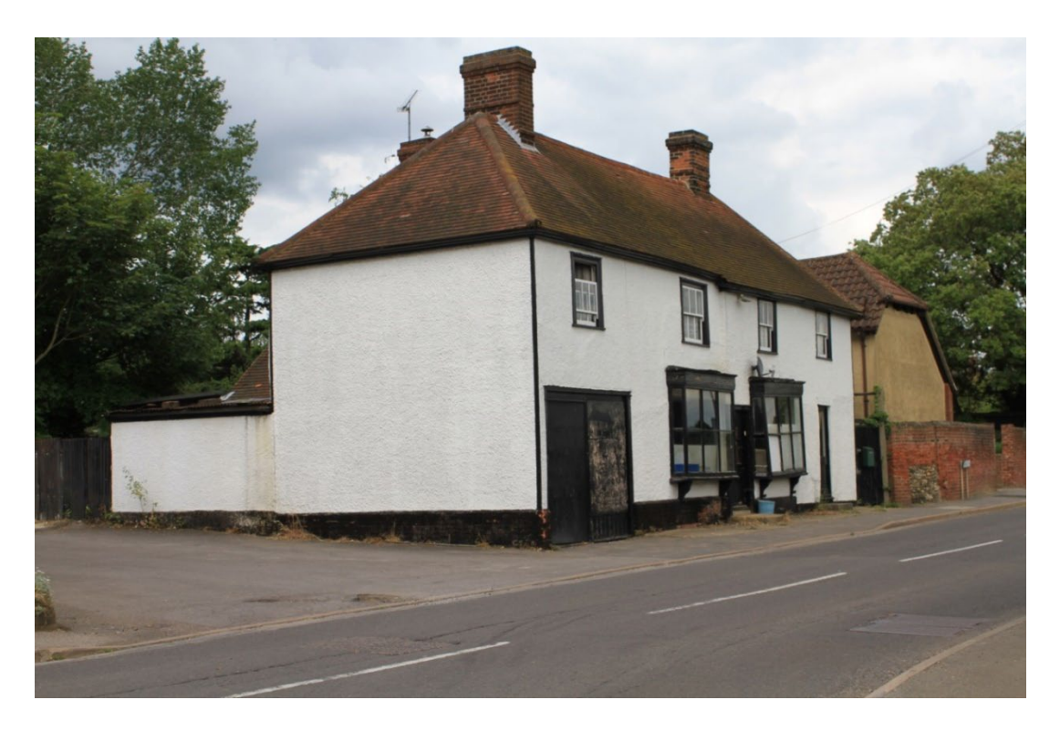
THE STORES AND HOUSE Name: THE STORES AND HOUSE List Entry Number: 1322535 Grade: Il Late C18 or early C19 timber-framed and plastered building. Two storeys. (Formerly Village Stores)