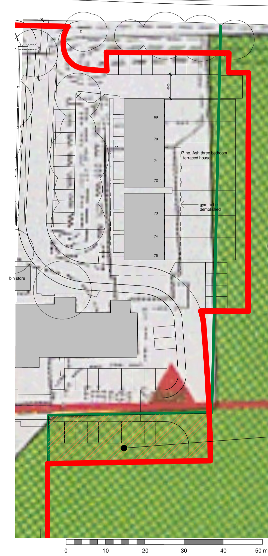
Proposed site plan with overlay from Local Plan Saffron Walden inset map 1:500

Proposed parking, soft landscaping and small part of access road within designated playing field 497.5 sq.m.