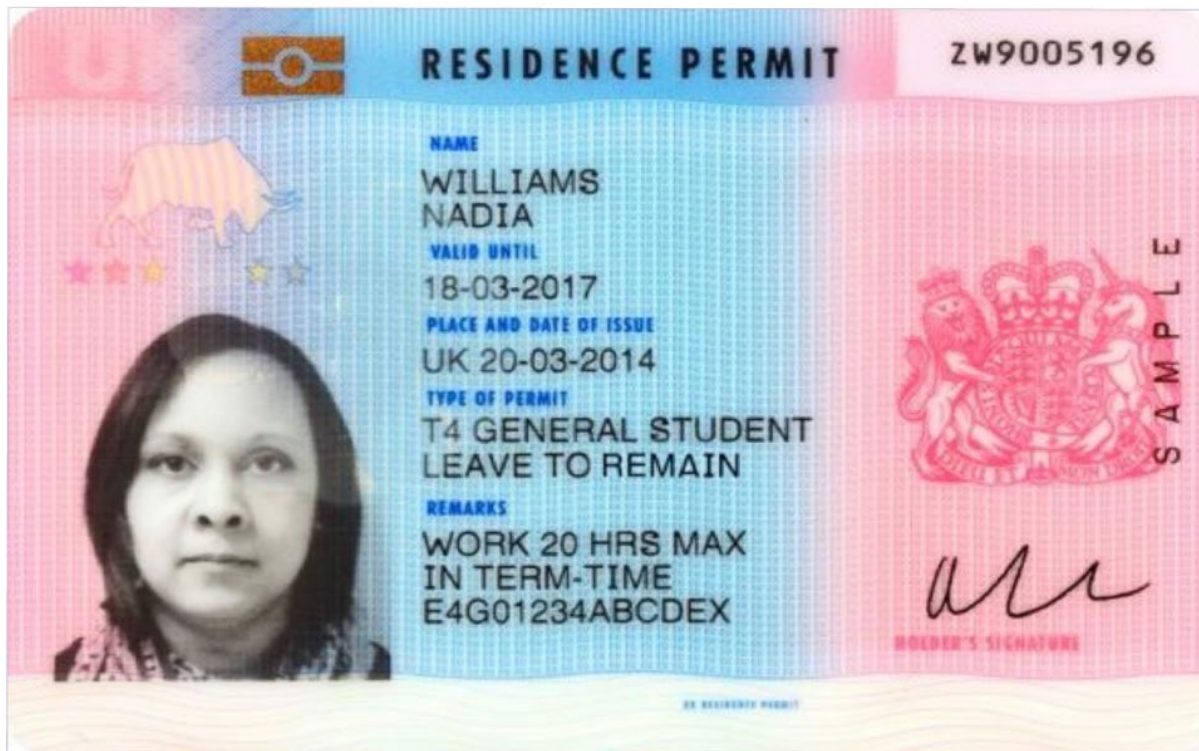
Figure 1 shows an example of a BRP: