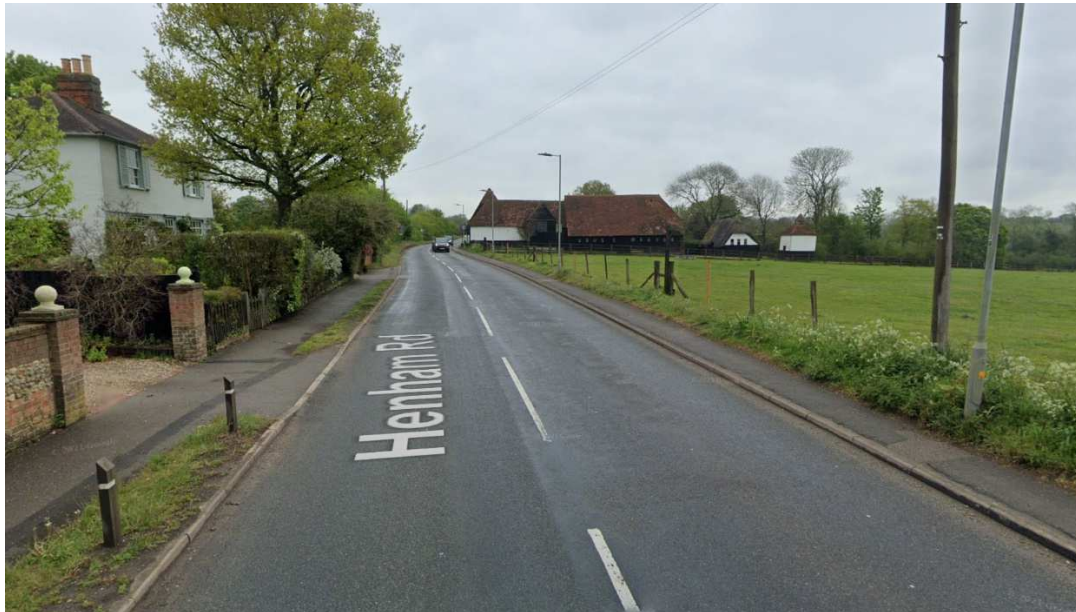
Figure 4: B1051, Elseham