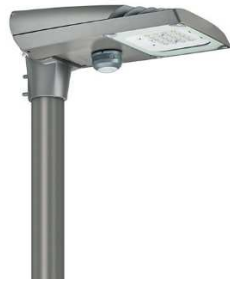
Figure 6: Philips Luma Gen2 Micro LED Lantern