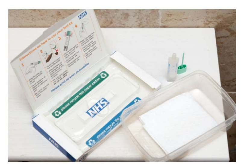
The FIT kit. Instructions for using the kit are inside the lid of the packaging. You can use a clean disposable container to collect your sample.