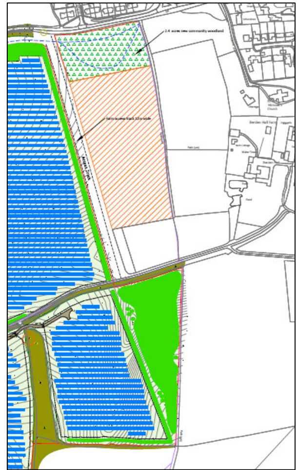
Figure 1 – New woodland planting

5.9 A second area of woodland will be created south of the wildflower meadow, see Figure 1, (area shown as upside down green triangle), this woodland will help to provide screening for the village and footpath users particularly from the east. The area of the site covered with solid infrastructure, i.e., panels, inverters, the access tracks, and substation totals 25ha the other 47ha of the site will be open, this open area includes the land between the panels, the 9m gap allows for species rich grass mix to be planted, encouraging skylark nesting. The remaining site area will be landscaped, benefiting from new hedgerows, woodland planting, and flower meadows. Figure 1 – New woodland planting