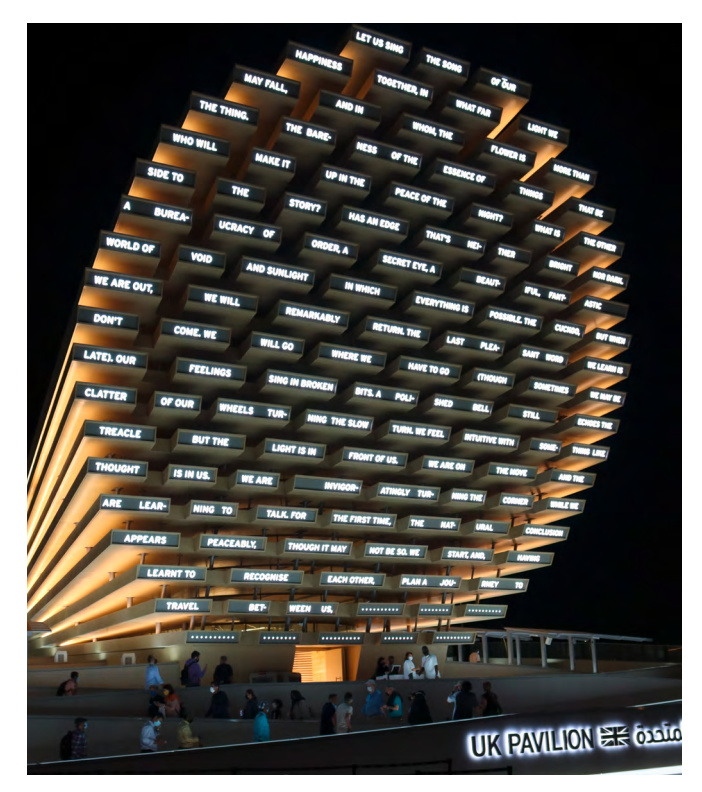
The UK Pavilion at Expo 2020 Dubai.

The Foreign, Commonwealth and Development Office has continued to work with the devolved governments both in the UK and overseas, and across a wide range of international facing issues. This has included visits made by devolved government ministers to Ireland and the postponed 2020 Dubai Expo, where civil servants worked together to facilitate and support these overseas visits.