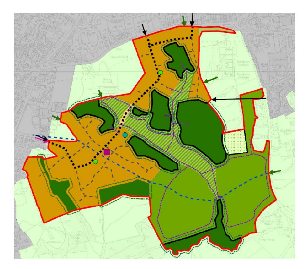
Sandleford SPD Masterplan Framework Figure 13

• To assist in the delivery of a comprehensive and sustainable development across the SSSA as a whole.