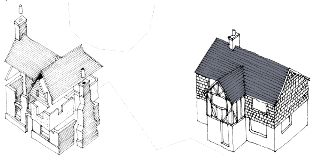
Material changes and detailing should be used in such a way as to explain the building

1.39 Facing and roof materials should be selected from the range of regional materials characteristic of Essex, or of that part of Essex where the project is located. This means using those materials present on pre20th century buildings in the locality. The traditional range includes red, yellow stock and white gault bricks, smooth rendering, black- or white-painted horizontal weatherboarding, plain clay tiles, clay pantiles, slates and thatch.