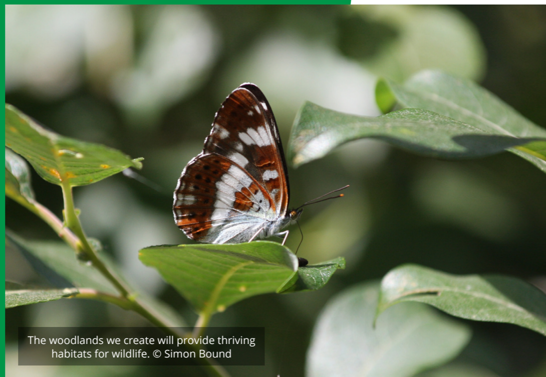
The woodlands we create will provide thriving habitats for wildlife.

If you're a new or established landowner, a farmer, a public body or a land agent acting on behalf of landowners, with a minimum of 50 hectares of land suitable for woodland creation, this scheme offers an opportunity to diversify your business and bring significant environmental and community benefits.