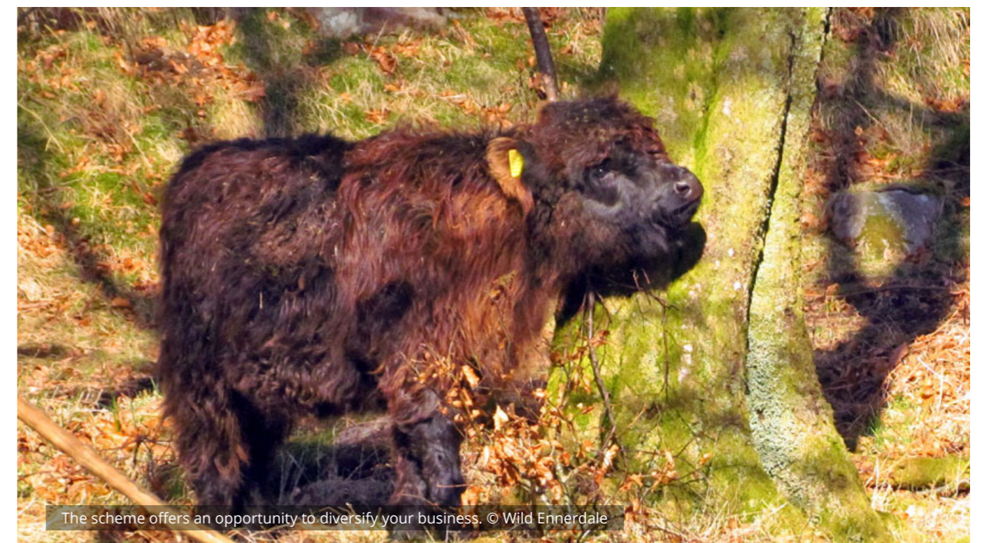
The scheme offers an opportunity to diversify your business.

www.gov.uk/guidance/create-woodland-overview