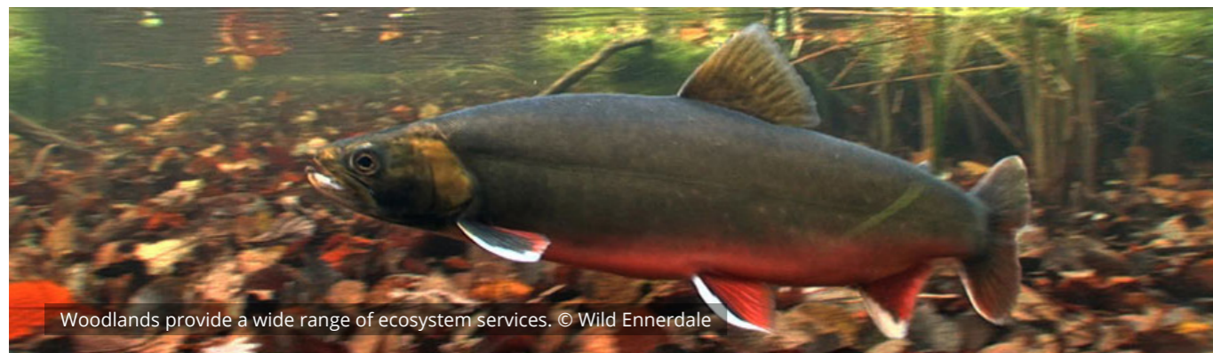
Woodlands provide a wide range of ecosystem services.

These woodlands will be places for people of all ages to enjoy and explore. Every new woodland will have public access, providing health and wellbeing opportunities to communities.