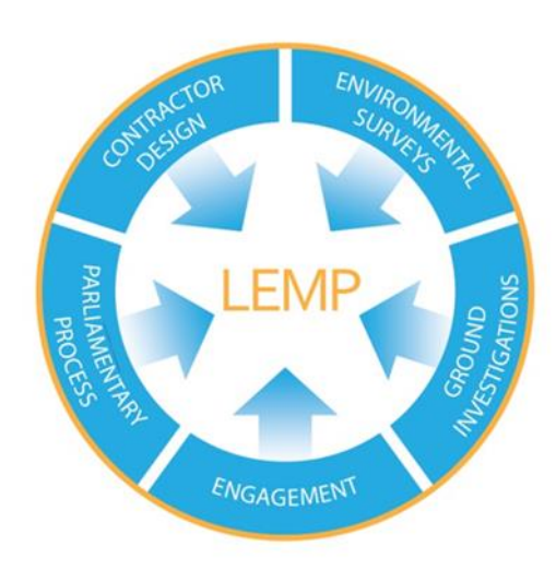
Figure 1: Key work streams that will provide additional information for the LEMPs.