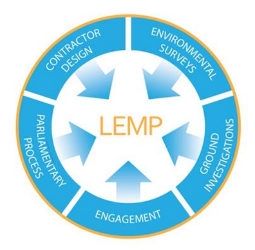
Figure 1: Key work streams that will provide additional information for the LEMPs.