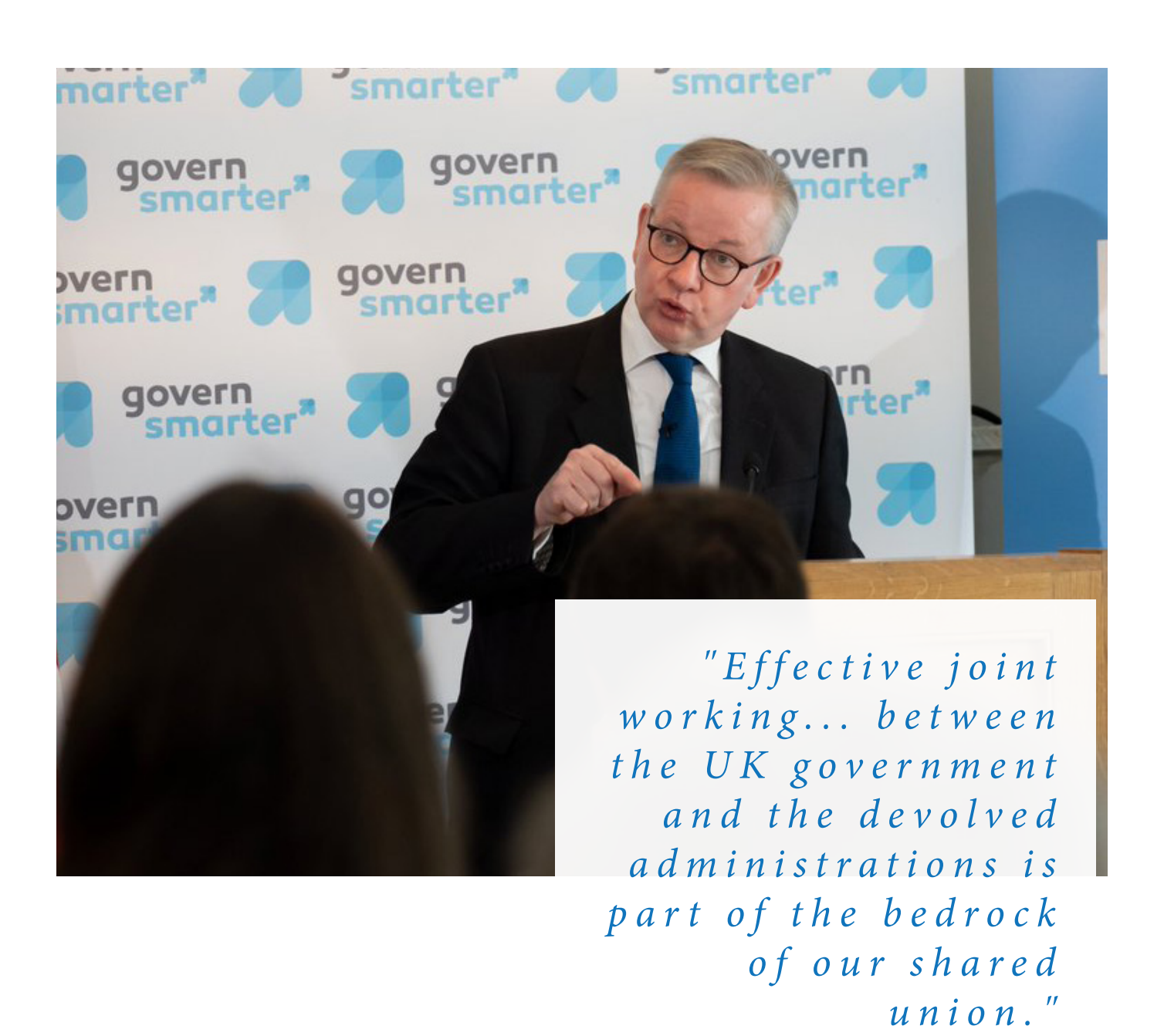
The Rt Hon Michael Gove MP Secretary of State for Levelling Up, Housing and Communities and Minister for Intergovernmental Relations