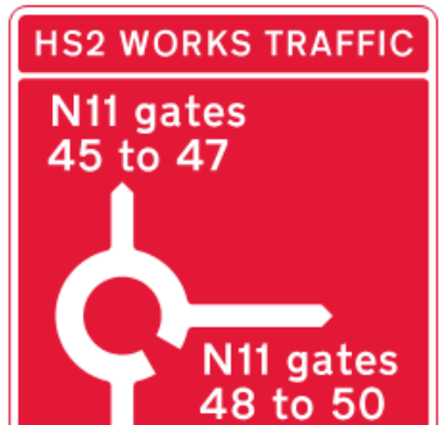
Double sided sign at site access