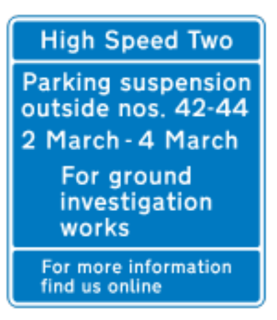
Figure 7.3: Signing for parking place and other kerbside suspensions

7.11.2.1. For temporary works in the highway, advanced warning signing for suspension of parking places and other kerbside space required for the works will be in accordance with the requirements of each highway authority. Where advanced warning signing is required to be provided by the Principal Contractor, signing should be provided to 40 x-height, with minor wording to 30 x-height. Typical sign layout is shown in Figure 7.4, with the colour, wording and other information signing to be agreed with the relevant highway authority. These signs are intended to be used should the highway authority not carry out the suspension signing: