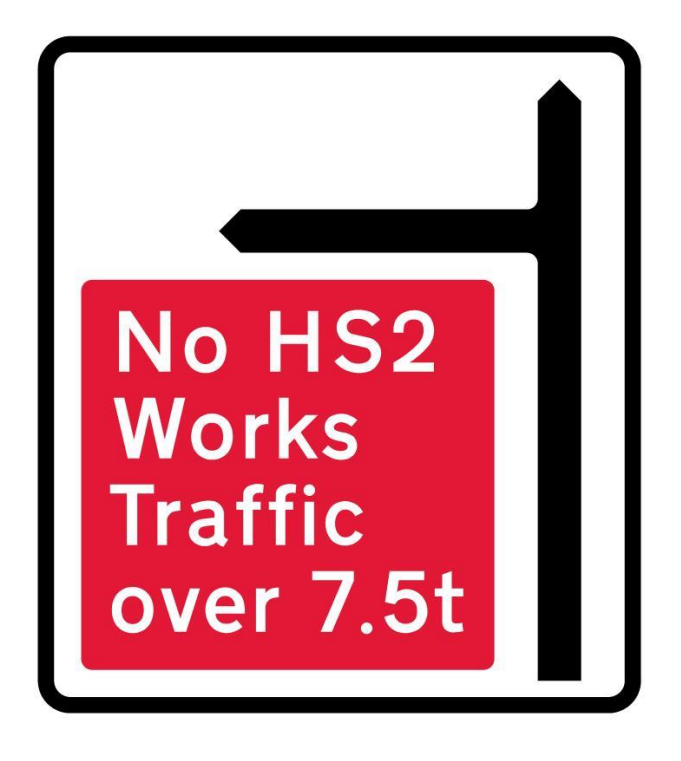
Figure 7.5: Advanced signing of a U&A restriction

7.12.14.1. The requirement for such signing in other locations, should be considered by the Contractor on a case-by-case basis but such signing should be considered for information and not enforceable