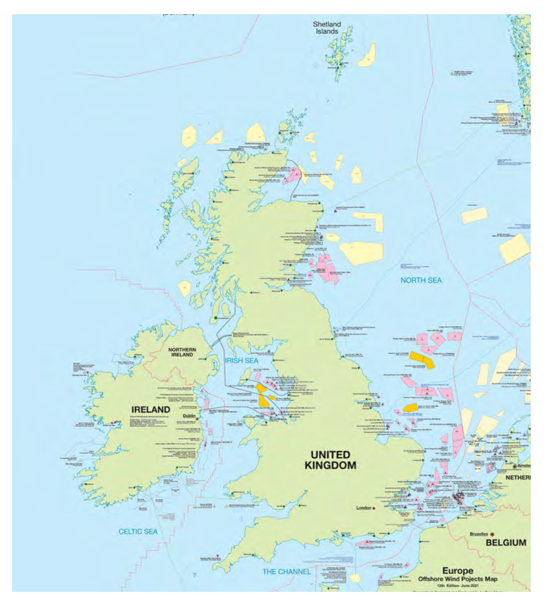
Offshore Windfarm Projects Map: La Tene Maps