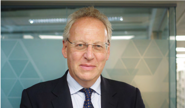
To The Right Honourable Robert Buckland MP, Lord Chancellor and Secretary of State for Justice.

I am delighted to be able to introduce the Law Commission's 55th Annual Report.