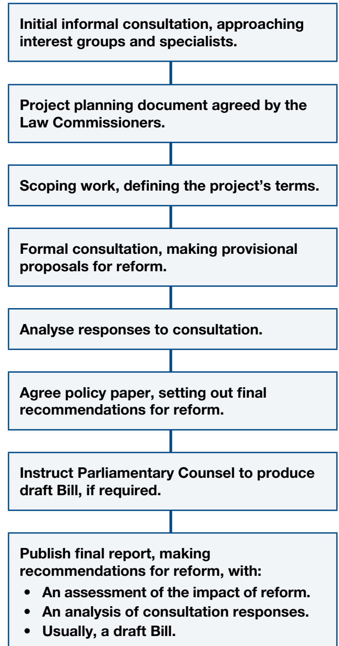
Figure 4.1 Common stages of a law reform project