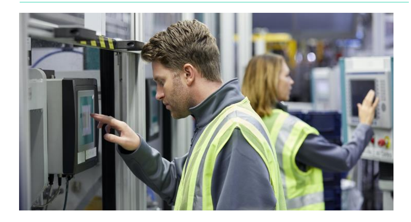
Theme 3: A just transition for workers in the high carbon economy

The 2015 Paris Agreement on climate change stated that countries must "[take] into account the imperatives of a just transition of the workforce and the creation of decent work and quality jobs in accordance with nationally defined development priorities." As a signatory to this agreement, the UK must manage the transition to net zero in an inclusive way, so that those affected workers have a voice in shaping the transformation.