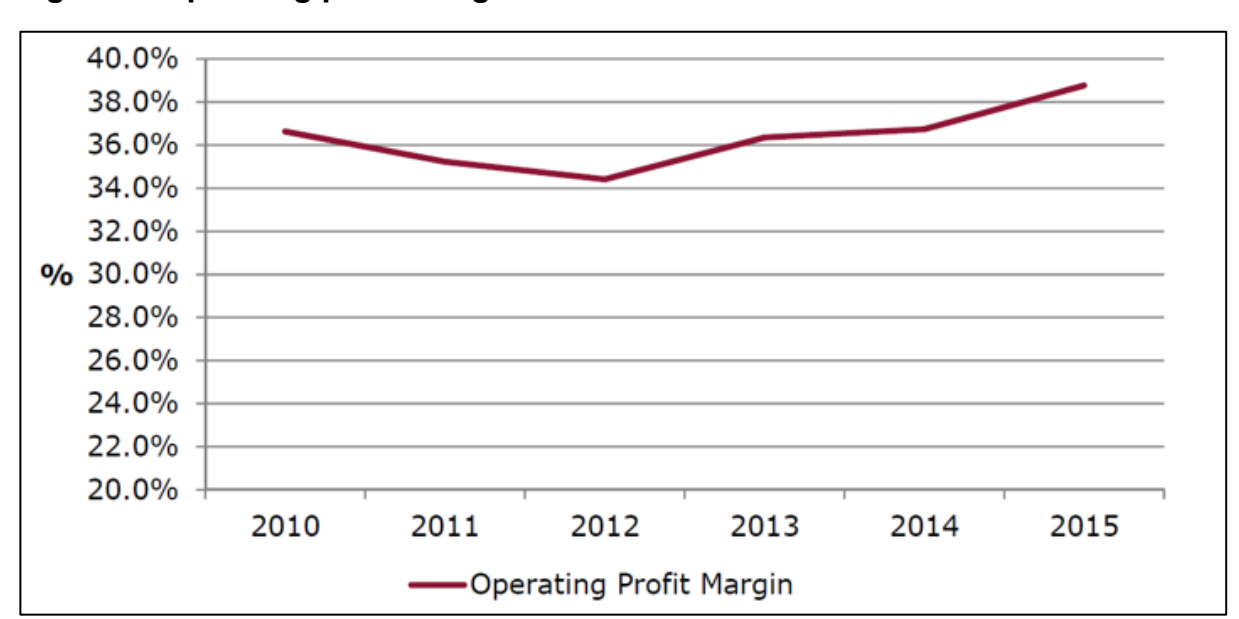
Figure 1: Operating profit margin