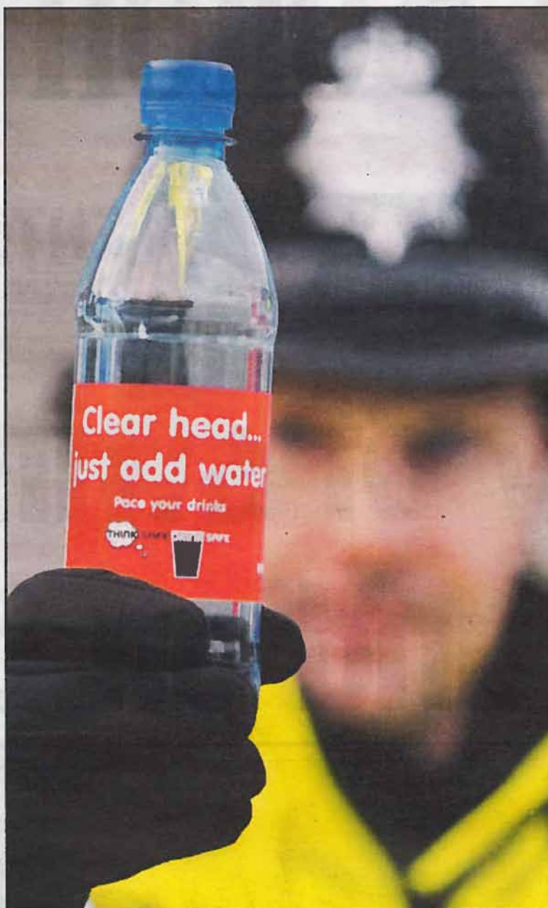
COOLING OFF: A police officer with a bottle of water which will be given to revellers over Christmas