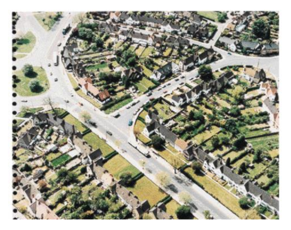
Image 7 - Aerial photograph, looking south west. Well Hall Road roundabout at left, with Well Hall Road running to bottom right; junction with Dickson Road at centre of photograph.

Image 6 - Aerial photograph, looking north. Well Hall Road running from bottom right to upper right; junction with Dickson Road bottom centre